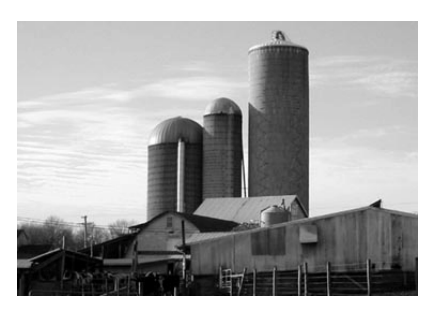
Fulper Dairy, West Amwell, Hunterdon County

Dairy Program − The Department helped the dairy industry complete a feasibility analysis and develop a business plan for producing a variety of locally produced, value-added dairy products to improve the profitability for participating milk producers. Specific objectives completed were the development of a business plan including a cost/revenue and return on investment analysis for the installation and operation of a micro dairy