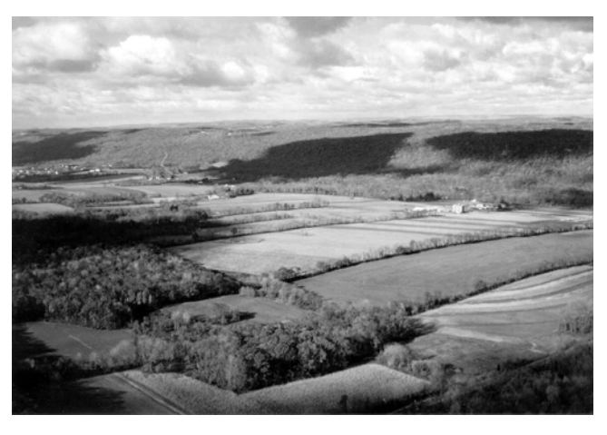
Long Valley in Washington Township, Morris County.

retain farmland and help farmers be more successful. Implementation of the Plan has been ongoing, with development of a Planners Tool Kit to support municipal governments, businesses, non-profit groups, and local citizens in their efforts to achieve the goals and objectives outlined in the Agricultural Smart Growth Plan. The Tool Kit, like the embraces the five Plan. key components that have been identified as critical for the future of farming: