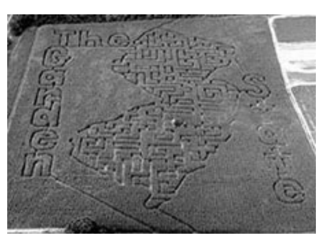
Corn Maze at K and S Farms in East Windsor.

Agricultural Fairs Association, New Jersey Equine Industry Advisory Council, New Jersey Direct Marketing Association, and New Jersey agricultural museums/living history farms; and four ex-officio members: the New Jersey Department Agriculture, New Jersey Farm Bureau, Rutgers University, and the New Jersey Commerce and Economic Development Commission. Council is an outgrowth of the Department's economic development