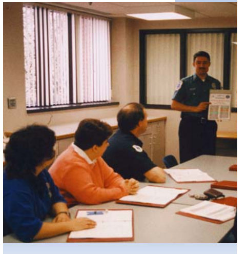
this standard are a lack of staff, time and funding. The following are a

It is an unfortunate reality that inservice training is the area most frequently cited as non-compliant during PSAP audits. The most frequent excuses for failure to maintain