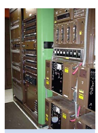
The replacement network will utilize Nortel DMS 100 Switches.

This program was reviewed by OETS staff and approved for 3 hours of inservice credit for attendees, the CTE number assigned is: CTE-02-056.