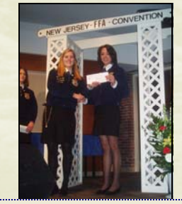
Many scholarships are awarded during the State FFA Convention in May.

Donations received from Agricultural Education supporters are invested for FFA leadership, chapter and individual incentive awards, career development events and special personal development activities.