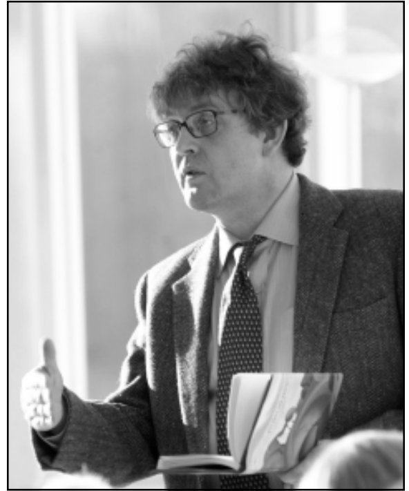
Pulitzer Prize winning poet Paul Muldoon will read at Ellarslie Mansion on March 24.

Trenton Artists Workshop Association is a