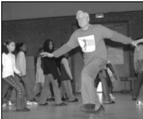
Ballet legend Jacques D'Amboise leads TEDI students in a challenging and enthusiastic class.

TEDI's Event of the Year, " Here's the Scoop " will be presented at the Patriots Theater at the War Memorial on Thursday, May 24 at 7 p.m. Preferred seating gala tickets are $30 and include admission to the post performance reception honoring Jacques d'Amboise. For more information and tickets, please call (609) 638-1556 or email TEDIkid@aol.com .