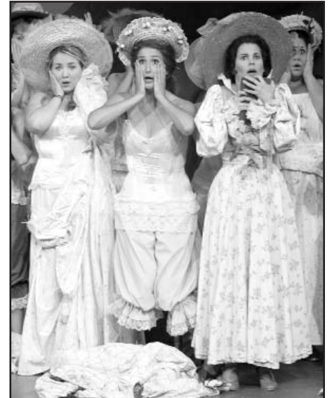
Major General Stanley's daughters, in Gilbert & Sullivan's The Pirates of Penzance .

Educational opportunities for young people include Masterclasses and Kid's