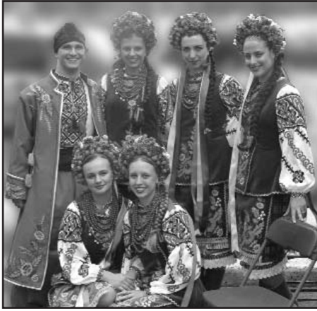
Voloshki Ukrainian Dance group performed at Trenton Heritage Days Festival last year.