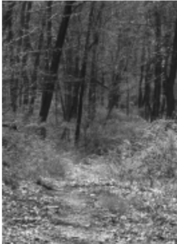
Trailblazing. Trails like this on Baldpate Mountain may someday be part of a Howell Farm "Heritage Trail."

Lawrenceville, and the Pennington Middle School. The ages of the children have ranged from 10 to 16, and most of the groups have been 10 members or less, plus some adult helpers. In addition to using handsaws and brush hooks to start clearing trails, the groups have also