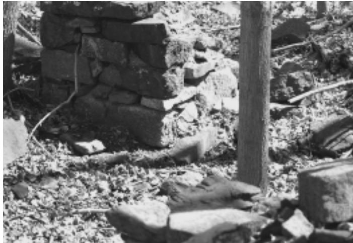
Farmhouse Ruins. The rocky foundations of historic farmsteads still remain on Baldpate Mountain.