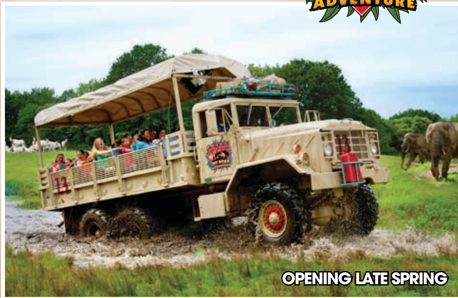
OPENING LATE SPRING

Six Flags Great Adventure will undergo its most dramatic transformation in 13 years as the 160-acre theme park and 350-acre Wild Safari animal park unite as one property to become the world's largest theme park. Get ready for the most intense animal experience ever on Safari Off Road Adventure where your group will climb aboard a rugged open-air safari vehicle and embark upon an off road adventure up close to the animals as you splash through ponds, climb hills, cross bridges and venture over rugged terrain.