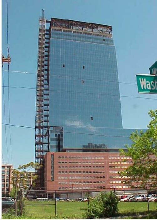
Harborside Financial Center, Plaza Five, 20 Morgan Street, Jersey City