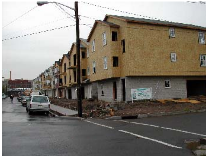
Three-family homes under construction in Newark's iron-bound district