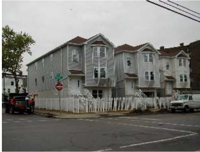
Buy-and-rent housing in Newark's north ward. Home buyers are able to live in one of the units and rent the other.