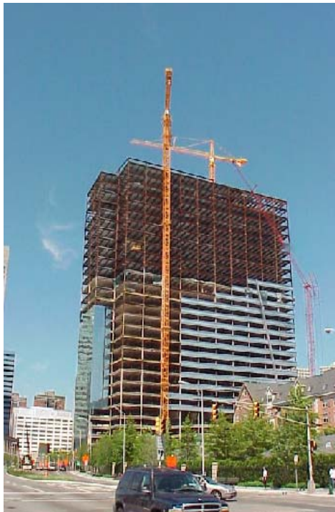
Newport Office Center VII, 480 Washington Boulevard, Jersey City