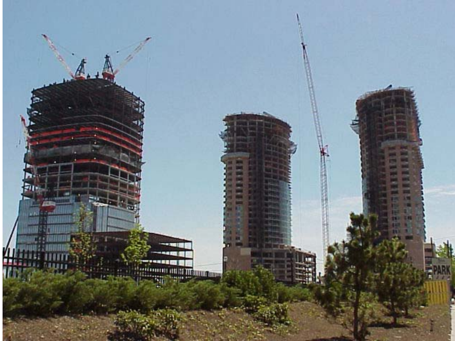
Liberty Towers East and West, 33 Hudson Street, Jersey City. The Goldman Sachs office building is on the left. The two buildings to the right are the apartment complex.

Along with the Goldman Sachs tower, two other new office buildings under construction were Harborside Financial Center Plaza Five and Newport Office Center VII. Plaza Five, a 34-story office building, is on Morgan Street. North of Plaza Five, on Washington Boulevard, is Newport Office Center VII, a 32-story office. All told, both buildings will have nearly 2 million square feet of office space. All of these office developments were well underway prior to the destruction of the World Trade Center on September 11.