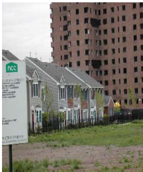
Community Hills Townhouses, 206-unit development in Newark's south ward. In the background is an old public housing development that the City will demolish.

Newark issued building permits for 1,066 new houses. The City demolished old public housing apartments in high-rise buildings and replaced them with affordable townhouses, duplexes, and apartments. The picture below shows townhouses in a 206-unit development under construction by the New Community Corporation, a nonprofit housing and community development agency. These affordable units were funded by a grant from the United States Department of Housing and Urban Development, and are located in the City's south ward.