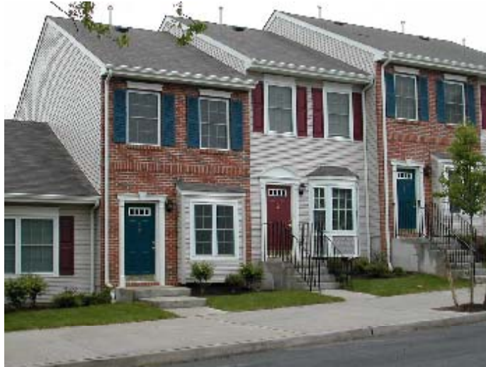
Community Hills Townhouses, Newark south ward