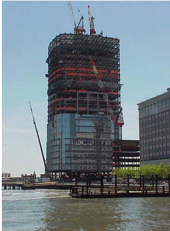
Goldman Sachs Tower and parking deck on Hudson Street, Jersey City

The biggest project in Jersey City was the Goldman Sachs office tower. The 1.5-million-square-foot building sits on the Hudson River waterfront, across from New York City's financial district. The picture below shows the tower which, when complete, will be the tallest in the State. The estimated construction cost reported on the initial permit was $242 million. This is the largest amount on a single permit in the more than six years that the Department of Community Affairs has published building permit data.