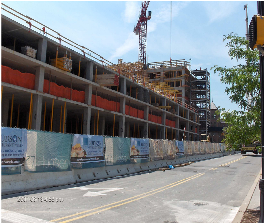
Work at the condominium development, 77 Hudson St., Jersey City.