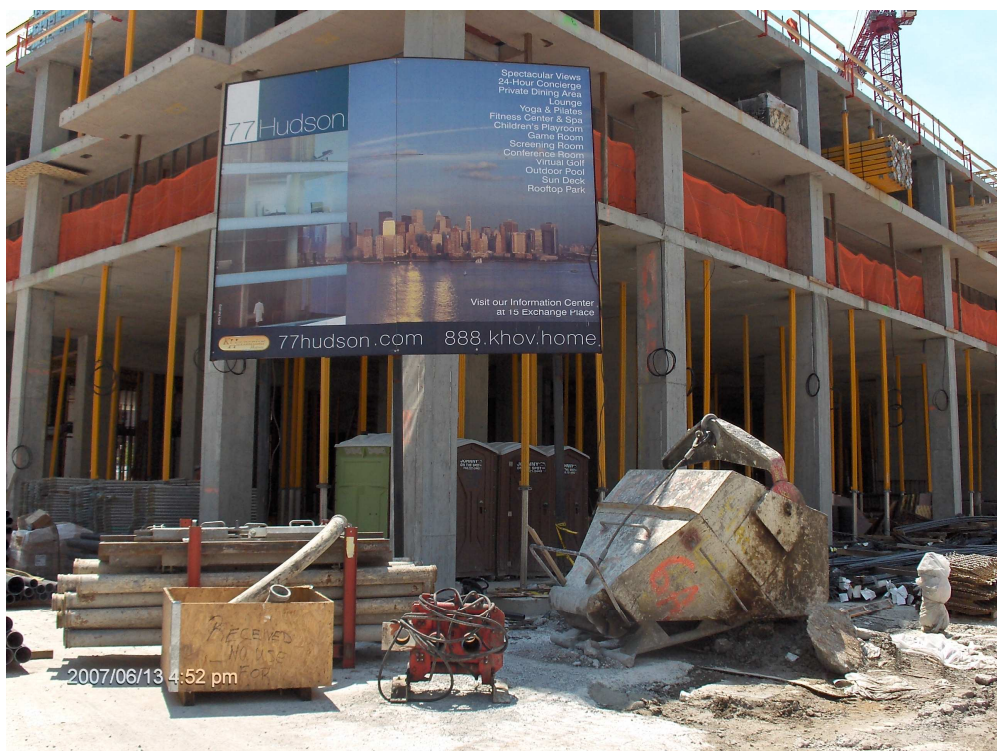
The construction site at 77 Hudson St., a high-rise residential development in Jersey City. The complex will have two towers and 901 condominiums.