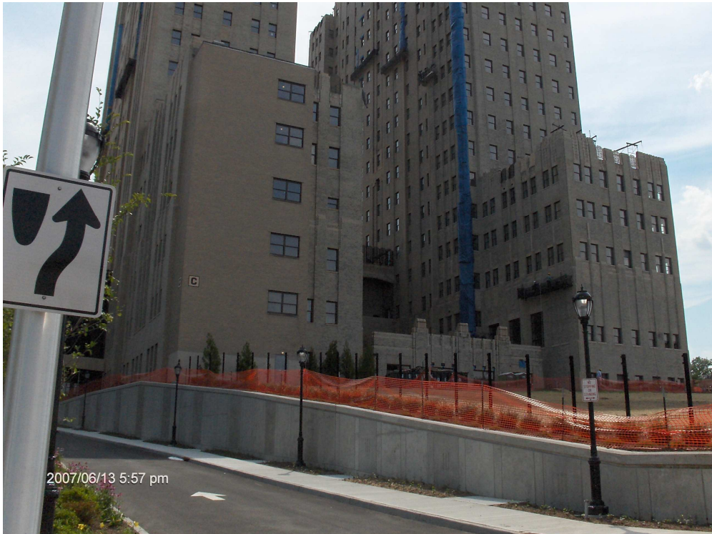
The Beacon condominium development broke ground in March 2006. The conversion of the former Jersey City Medical Center will result in over 300 new condominiums.