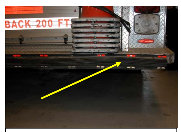
PHOTO 1: Shows rubber bladder component of the "BACKSTOP" system, and pre-existing impact damage near right corner area of rear step bumper of E-2. This is also believed to be the area where FF Stephens was struck.

It should be noted that the testing performed during this investigation cannot confirm the outright failure of this system during this incident. However, if the rear step bumper area of E-2 had not been damaged, and the components of the BACKSTOP® system had been operable, the system could have locked the truck's brakes as designed.