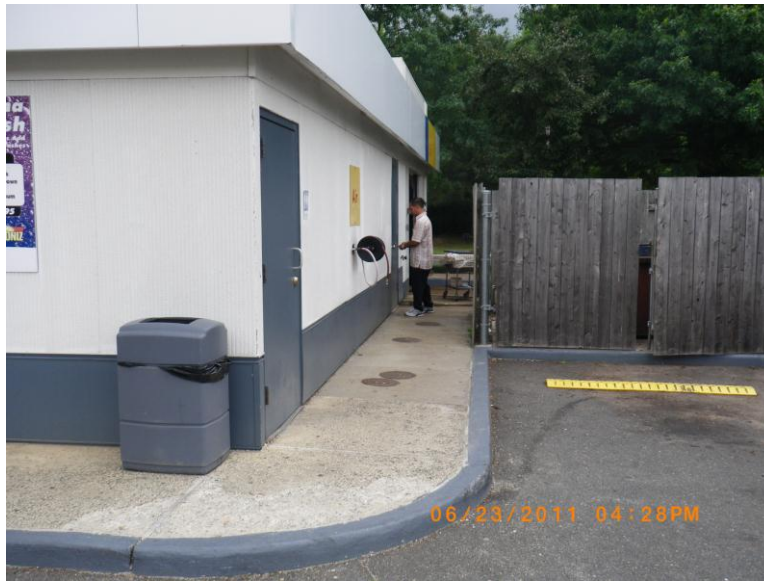
"Right Side View"

If submitting more photographs than will fit on the preceding page, affix the additional photographs below. Identify all photographs with: date taken; "Front View" and "Rear View"; and, if required, "Right Side View" and "Left Side View."