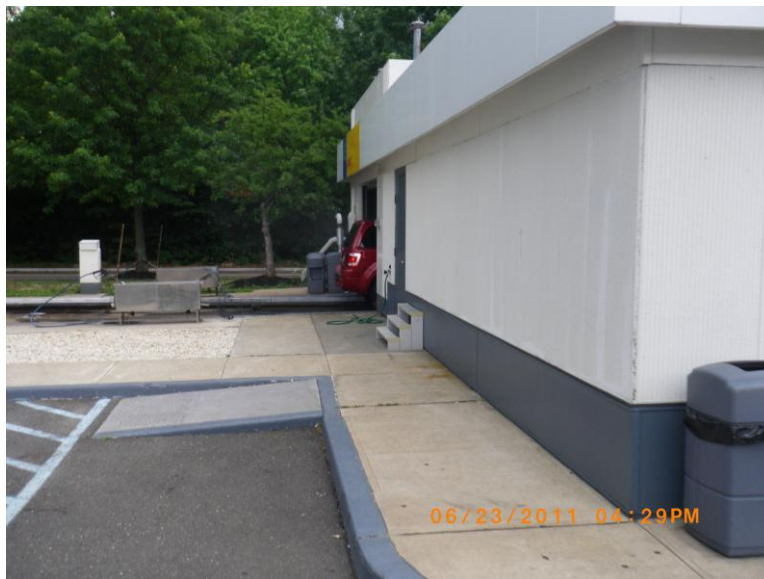
"Left Side View"