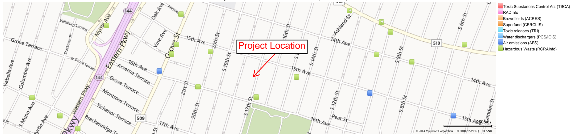
NEPAssist EPA Facilities Map - NEP011 - 525-527 S 17th St., Newark, NJ