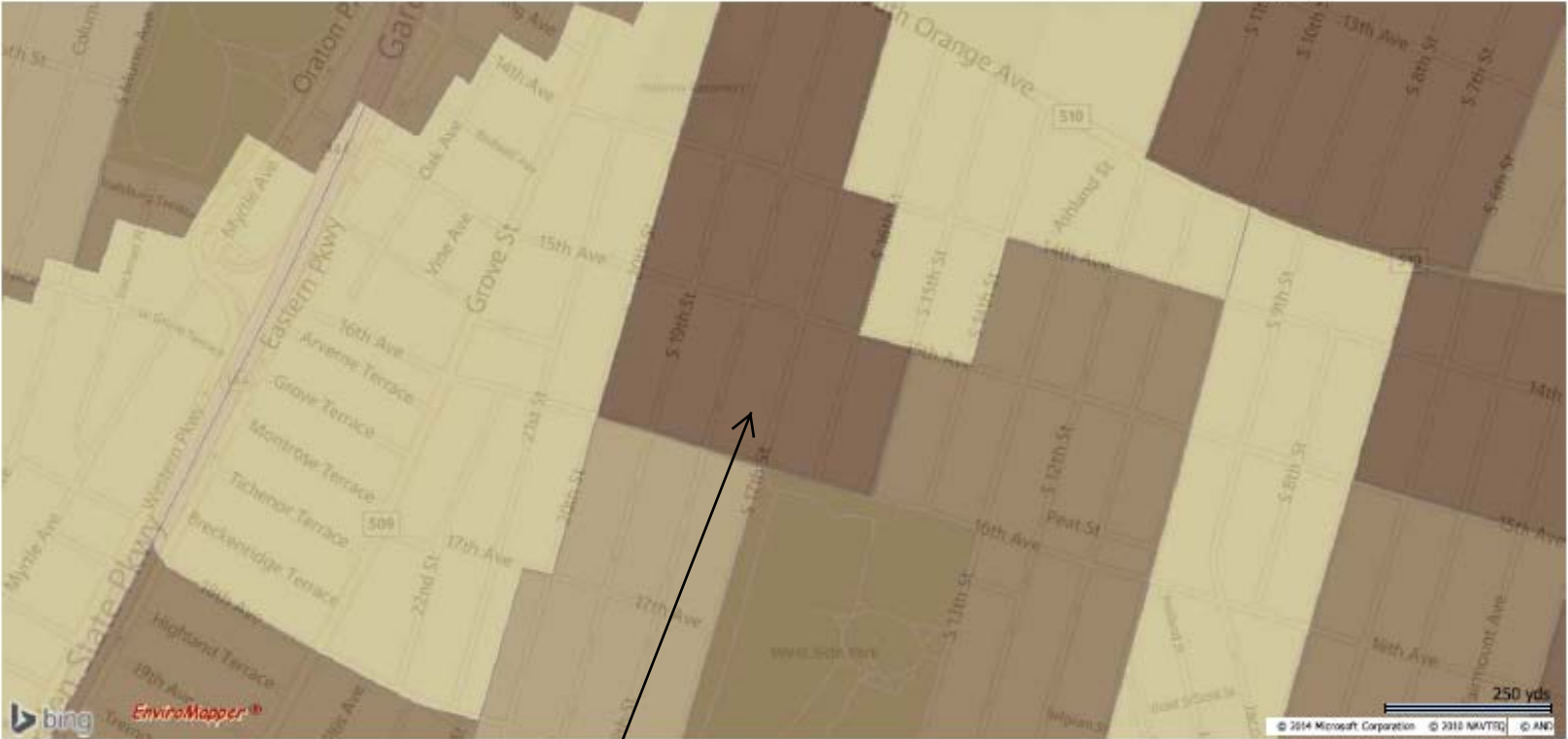
NEP0011 - 525-529 South 17th Street, Newark, New Jersey - Environmental Justice - Below Poverty (%)

525-529 South 17th Street, Newark, New Jersey