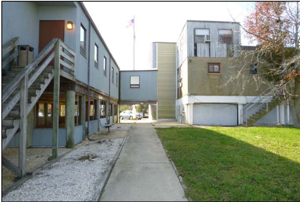
Photograph 3: Northern elevation of Emergency Operations Center (right) and Coast Guard Station (left) showing connecting bridge

8-Step Floodplain Analysis - Executive Order 11988, HUD 24 CFR 55 NCR40023 420 Pelham Avenue, Beach Haven Borough, Ocean County