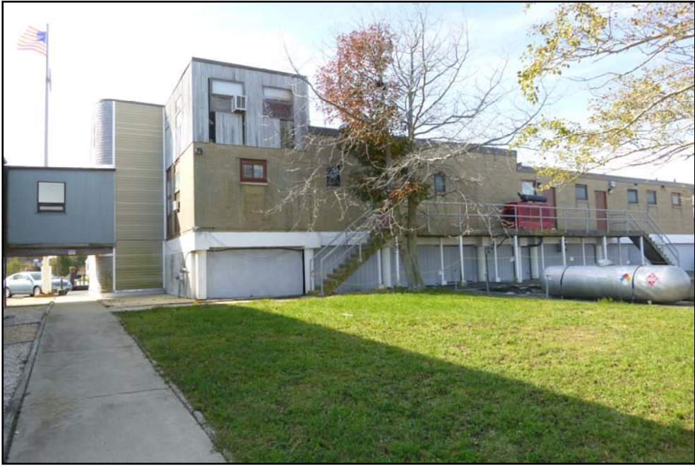
Photograph 2: Northern elevation of Emergency Operations Center