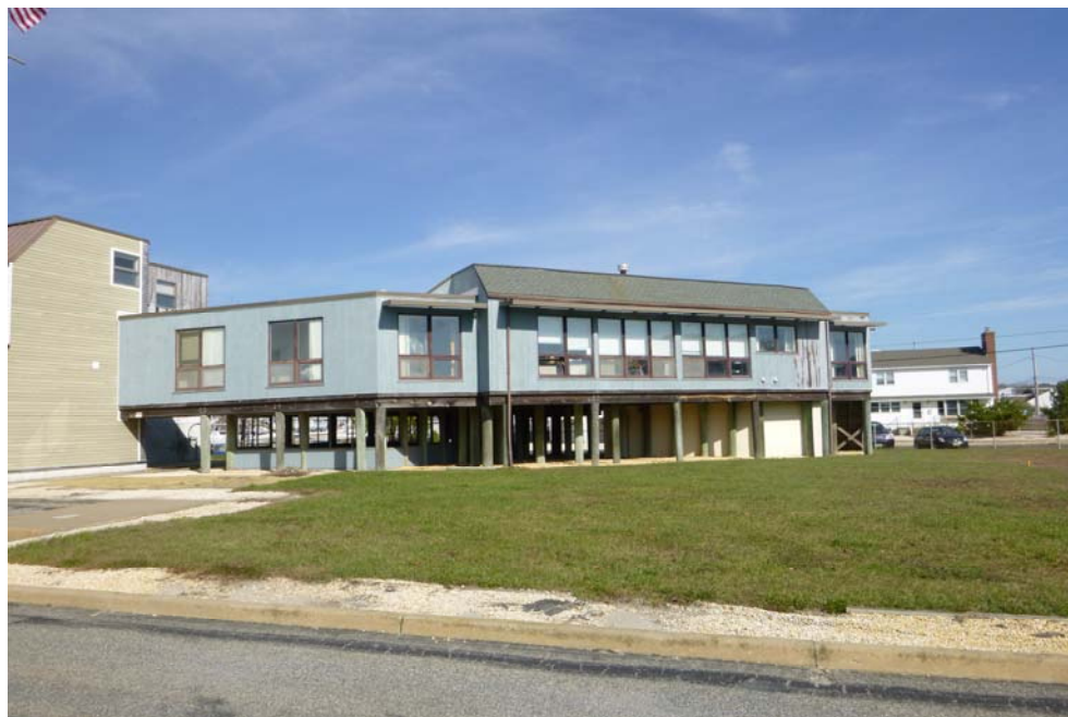
Photograph 4: Southern elevation of Coast Guard Station