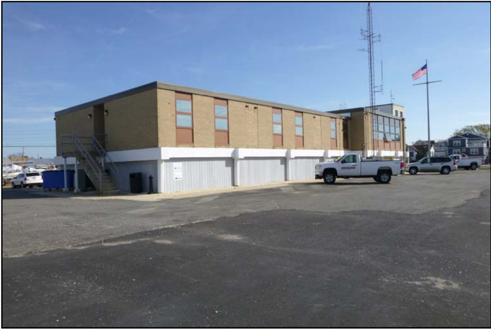
Photograph 1: Western/Southern elevation of Emergency Operations Center

8-Step Floodplain Analysis - Executive Order 11988, HUD 24 CFR 55 NCR40023 420 Pelham Avenue, Beach Haven Borough, Ocean County