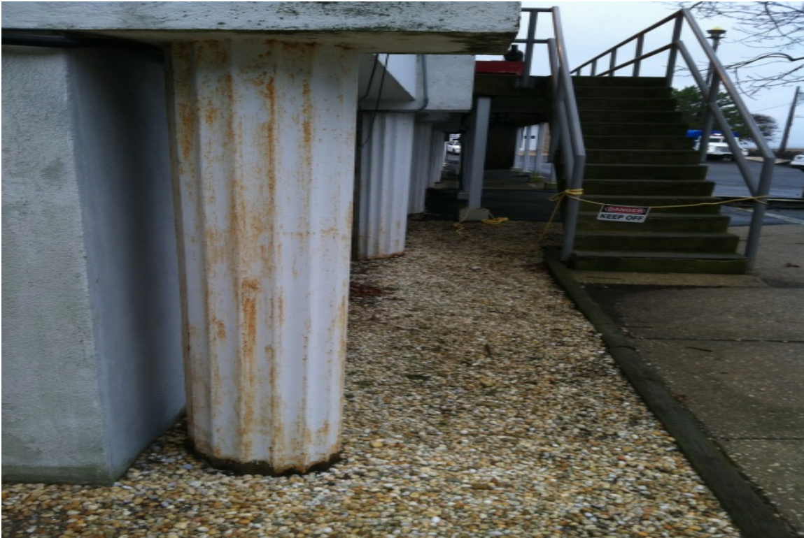
Photo 5: Representative Exterior Column at Municipal Court Section