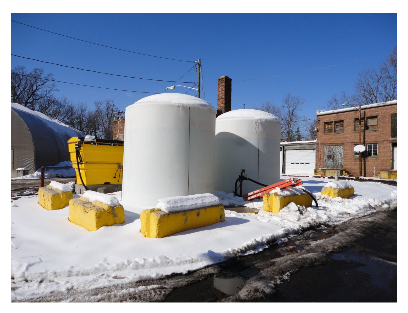
Salt Brine Tanks