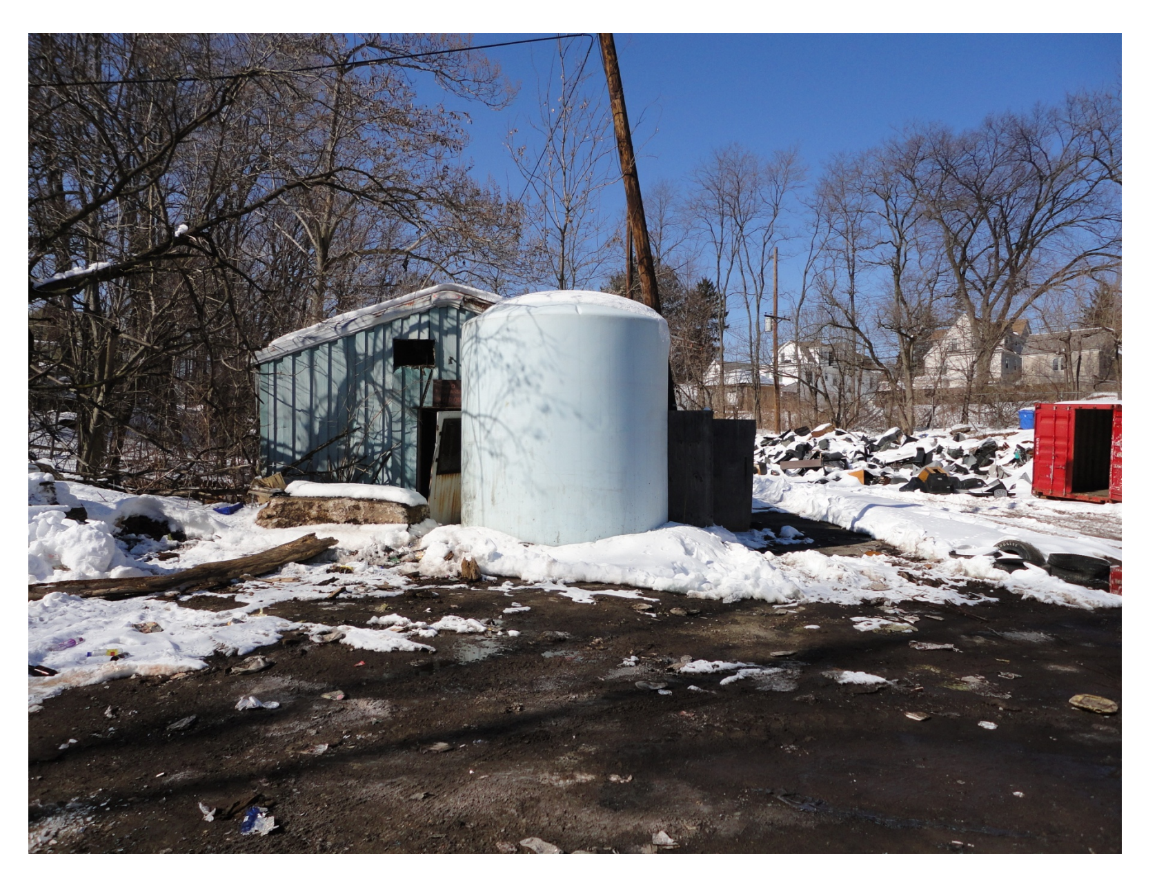
Calcium Chloride Tank