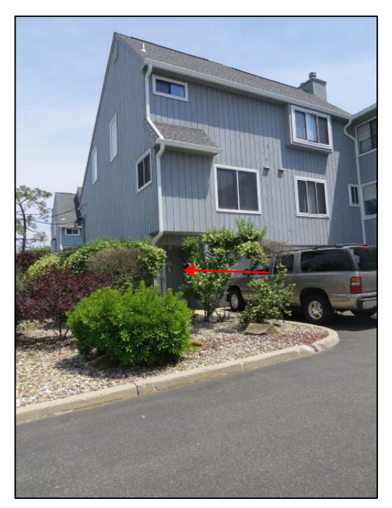
Photograph 1: Front of subject property.