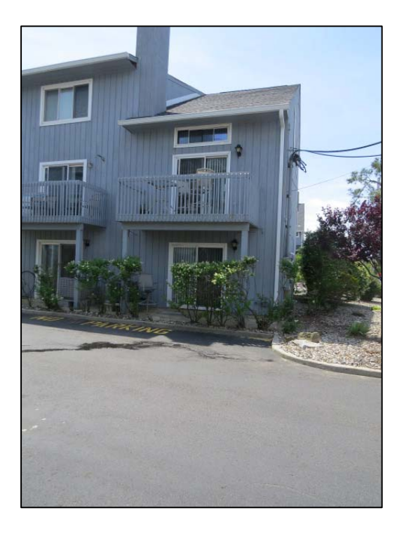
Photograph 2: Rear of subject property.