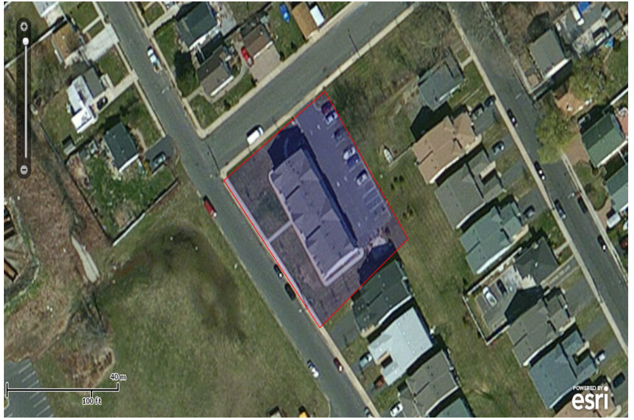
Project Location Map: