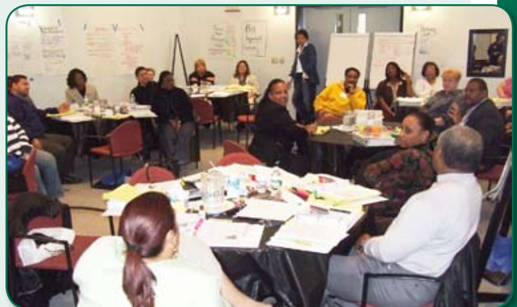
HMFA, in partnership with NeighborWorks America, hosted a weeklong training session for housing counselors.

In partnership with NeighborWorks America, hosted a weeklong training session for housing counselors throughout the state focusing on foreclosure and default mitigation. The training was conducted by NeighborWorks instructors from March 31st through April 4th. Thirty counselors from 12 housing counseling agencies benefited from the experience.