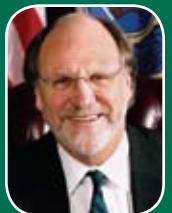
Jon S. Corzine Governor, State of New Jersey