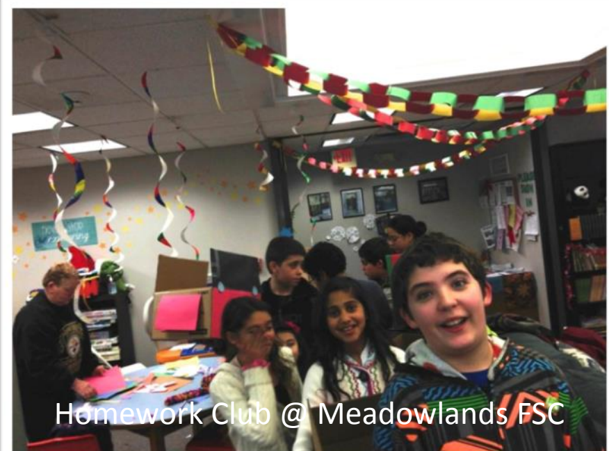
Homework Club @ Meadowlands FSC