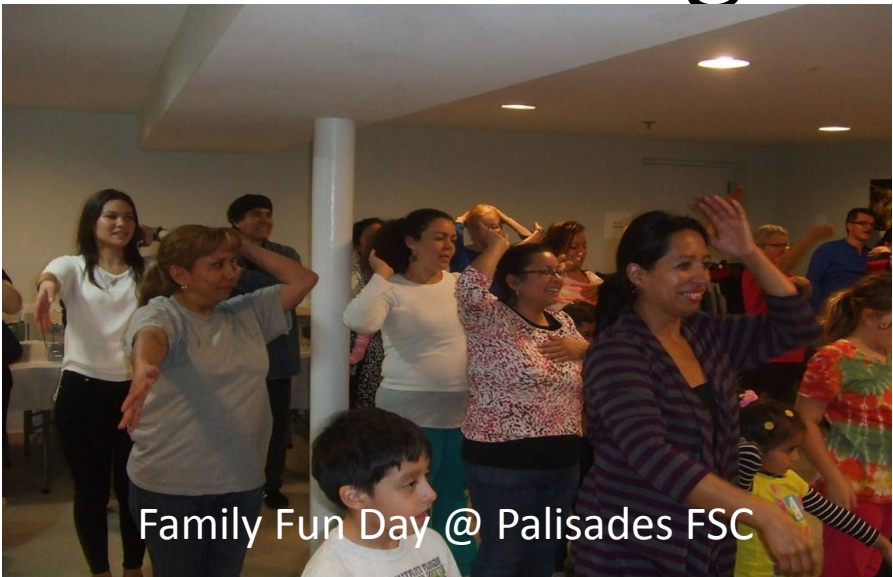
Family Fun Day @ Palisades FSC