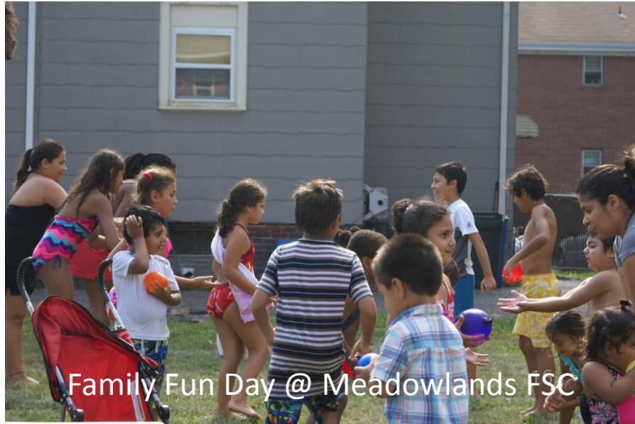
Family Fun Day @ Meadowlands FSC