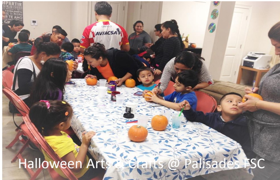
Halloween Arts & Crafts @ Palisades FSC