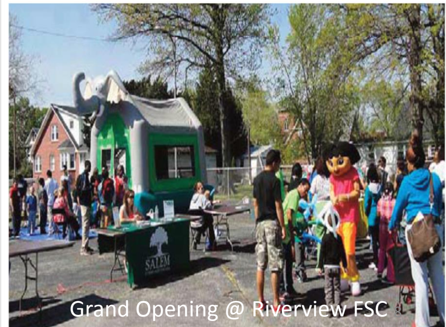
Grand Opening @ Riverview FSC