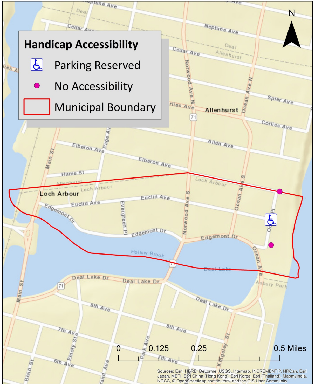
Map 3: The Village of Loch Arbour Enhanced Public Access Locations