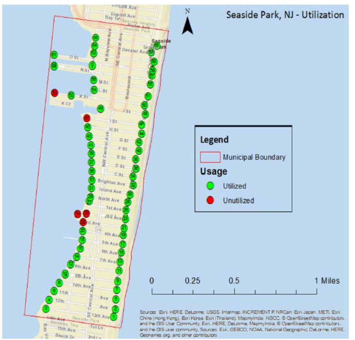
Note: ADA handicap accessible public access locations are located on 13<sup>th</sup> Avenue, 7<sup>th</sup> Avenue, F Street, and Decatur Avenue.