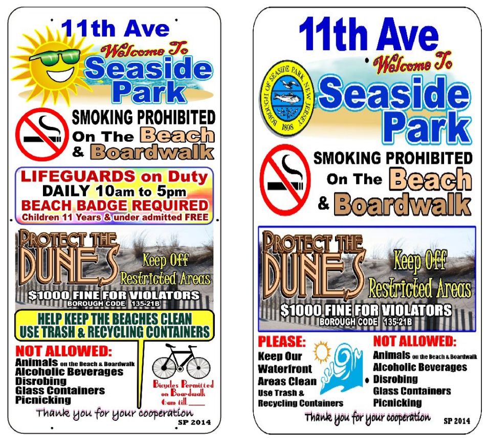
Figure 1 - Summer Sign Detail