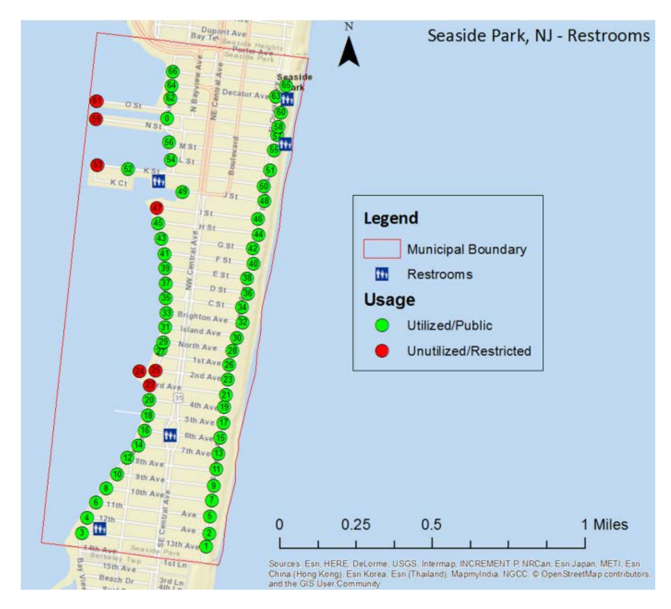
Note: No beach access exists on the oceanside at 12<sup>th</sup> Ave, 10<sup>th</sup> Ave, 8<sup>Th</sup> Ave, 6<sup>th</sup> Ave, 4<sup>th</sup> Ave, 3<sup>rd</sup> Ave, 1<sup>st</sup> Ave, Island Ave, C Street, E Street, G Street, I Street, K Street, and N Street.