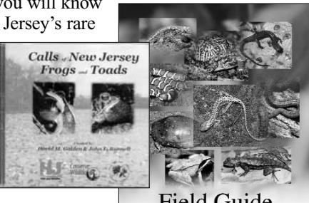
Field Guide <sup>to</sup>Reptiles<sub>and</sub> Amphibians of New Jersey

spring and even caught the attention of nature lovers in the UK and Europe! It features 38 tracks of 16 different amphibian species. A companion to the CD is our Field Guide to Reptiles and Amphibians of New Jersey , a beautiful book that contains more than 100 full-color pictures