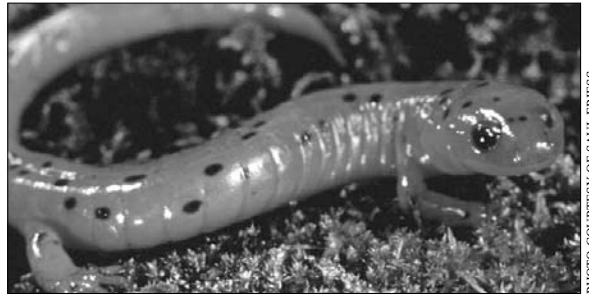
Eastern tiger salamander (above), Eastern mud salamander.

egg masses and tiger salamander larvae in vernal pools. This spring ENSP biologists are surveying vernal pools for the salamanders. The search will be concentrated in Cape May County, the stronghold of the Eastern tiger salamander, as well as in Atlantic and Cumberland counties.