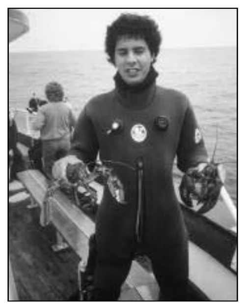
New Jersey divers catch nice lobsters.