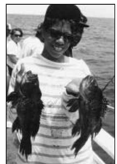
Sea bass are caught on wrecks and reefs.