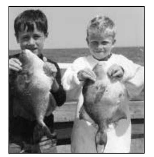
Triggerfish look strange, but taste great.

A.N. Charters, Charter, 35', 4 passengers Capt. Rich, 250 Bellevue Avenue, Upper Montclair, NJ 07043 D/N: 973-744-2100 May - December; Full-Day Fluke, Striped Bass