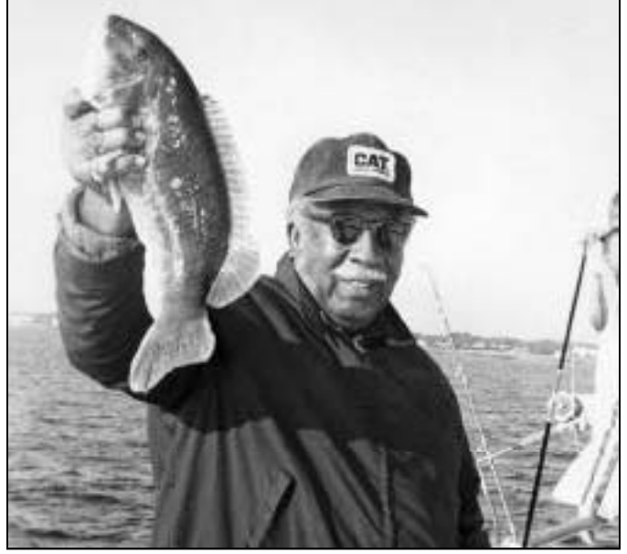
Blackfish bite best in spring and fall.