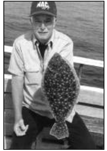
Fluke are one of New Jersey's premiere gamefish.

www.dukeofluke.com/ email: info@dukeofluke.com