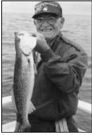
Weakfish are fall favorites.