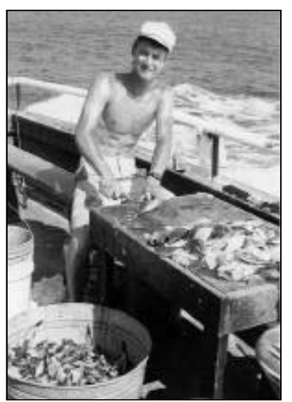
Don't forget to tip the mate.

Fluke, Tuna, Weakfish, Striped Bass, Wreck/Reef, Shark, Bluefish, Night Bluefish