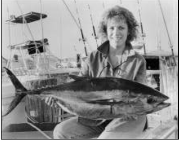
Tuna are caught in offshore, blue waters.