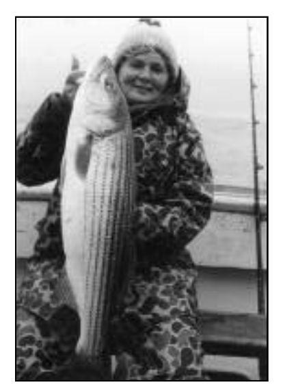
A Delaware Bay striper