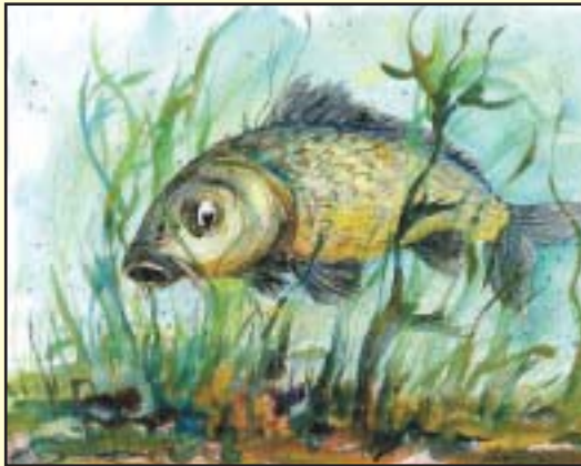
Anca Valeanu, grade 7, one of 10 contest winners for 2003.

The contest is open to all students in grades four through eight. This is an art and writing contest based on the Aquatic WILD activity "Fishy Who's Who". A full description of this activity available for those teaching grades five through eight can be found on Fish and Wildlife's Web site: www.njfishandwildlife.com . (This activity can help teachers meet New Jersey Science Standards 5.12.4 and 5.74.1.)