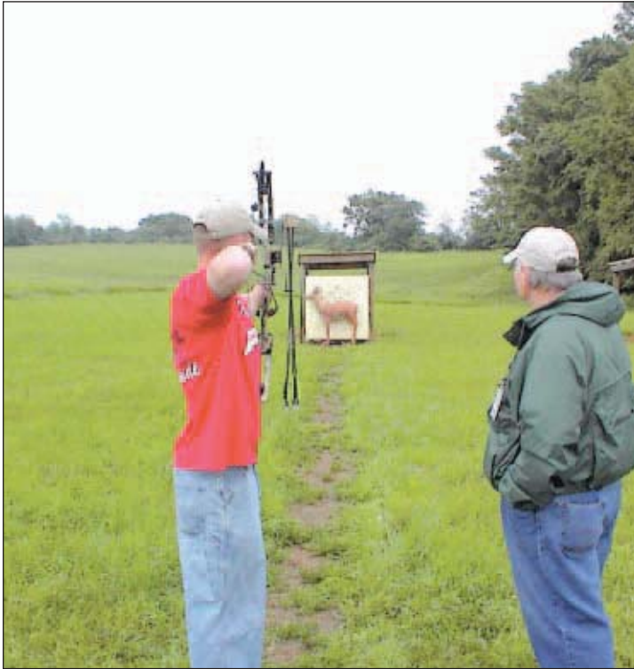
Instructors work one-on-one with students during the Hunter Education course's archery shooting proficiency.