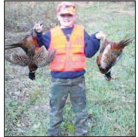
A proud hunter with his Youth Pheasant Hunt quarry.

The 2004 Take a Kid Hunting Pheasant Hunt will allow properly licensed hunters with a valid youth license to hunt on one of nine stocked Wildlife Management Areas (WMA) on Saturday morning, Nov. 6, 2004. In a cooperative effort between the Division of Fish and Wildlife and the NJ State Federation of Sportsmen's Clubs, volunteer hunting mentors with trained bird dogs will guide youth hunters on a pheasant hunt. This experience will increase the young hunters' opportunity for harvesting a pheasant in a setting which encourages responsible and safe hunting practices.