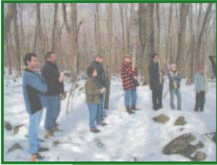
Hunter Safety Education