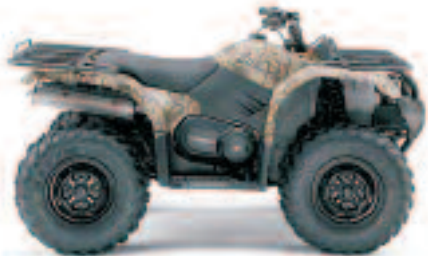
2006 Yamaha Kodiak™ 450 Auto. 4x4

We are located near the NJ Turnpike. Exit 8 to Route 33 East, 5 Miles on Left