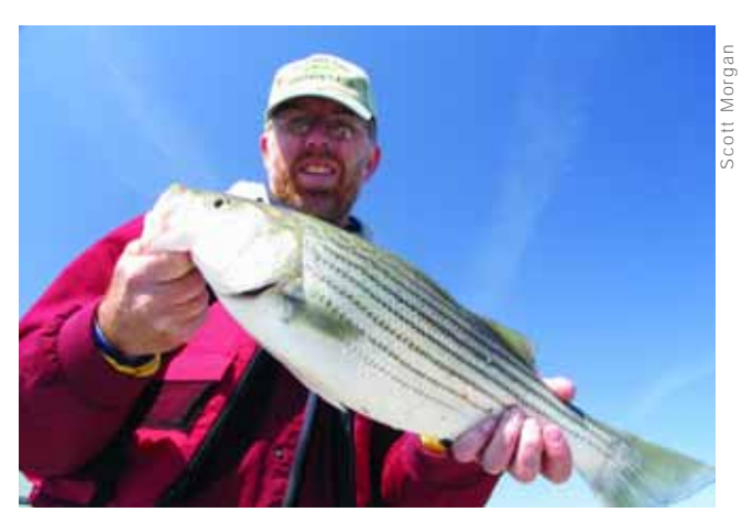
Although not trophy specimens, 24 -inch stripers such as this one still offer a lot of excitement to anglers up and down the Delaware.