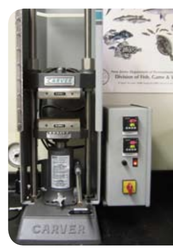
Fish scales are heated in this press to burn an impression onto an acetate slide.