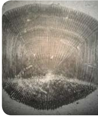
Scale from five year old striped bass.

the belly of a striper, record the tag number, length, date, location and capture method. If you cannot record the data, cut the tag at its base, retain the tag, then call (800) 448-8322 to report the recapture. The USFWS will send information from when your fish was tagged and will reward you with a hat. Good luck and keep looking for the pink tags.