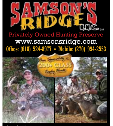
Physical Address: 695 Concord Church Lane, Vienna, IL 62995 Mailing Address: 5156 Old Marion Rd., Metropolis, IL 62960

• It is unlawful to hunt for deer with the aid of an electronic calling device or any device that casts a beam of light upon the deer.