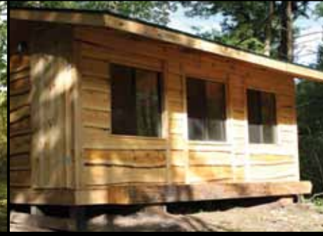
Affordable Sportsman's Package—ALL for only $25,995