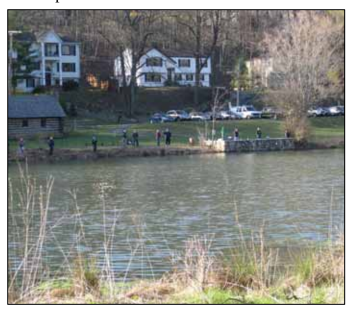
Burnham Park Pond on 4/7/2012

Angler counts are made at 8 a.m. when the trout season opens. All individuals who are fishing and about to fish are counted by angler survey clerks to help determine angler turn-out. Counting children (under 16 years) and anglers on boats is also done to provide more in depth information to the Division. Getting to a good vantage point and binoculars can be very helpful. Total counts of anglers fishing are made at 8 a.m., 10 a.m., 11 a.m., and 12 p.m. The counts made at 8 a.m. are used to