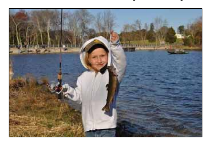
Shaws Mill Pond on 4/7/2012

Traditionally, anglers kept their catch in a wicker basket, also known as a creel. Even though anglers commonly opt to store their catch on a stringer or in a cooler, the term creel still refers to what an angler has caught. Angler Surveys enable the Bureau of Freshwater Fisheries to gather information about angler success, fishing preferences, interests, and attitudes not only about trout stocking but also about the Division's Freshwater Fishery program. The intent of this type of data is to provide the Division with information to better understand anglers, provide better service, and ultimately improve fishing throughout New Jersey.