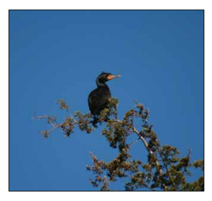
Echo Lake cormorant on 4/7/2012

gauge angler turnout and to keep continuity in data that has been collected in the past.