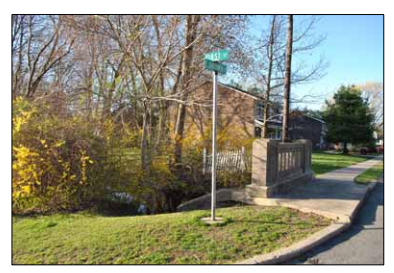
Above: Trout Brook at intersection of 1<sup>st</sup> and Baldwin St. on 4/7/2012; Left: Trout Brook fishing conditions near Charles St. on 4/7/2012; Photo Credits: Gerry Vitiello