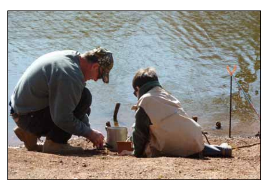
Roosevelt Park Pond on 4/7/2012

A complete list of Opening Day angler turnout (including surveys conducted on streams or rivers) can be found in Table 2 along with trout catch information. Musconetcong River (Stephens State Park) and Ponderlodge Pond anglers were very successful catching 390 and 134 trout, respectively. Waterbodies that had "slow" fishing included Clinton Reservoir (1 trout caught) and Holmdel Park Pond (9 trout caught). Musconetcong River (Stephens State Park), Ponderlodge, Manny's Pond, Seeley's Pond, and Shaws Mill Pond saw the most trout caught on Opening Day.