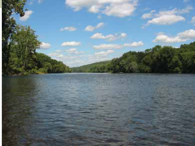
Delaware River near Stockton.

Anglers should also be aware that several procedural changes are now in effect for the Record Fish Program. First, there are different applications for freshwater and saltwater species. Second, for freshwater species, it is now mandatory that a freshwater biologist confirm the identification and weight of any potential record fish within three days of it being caught. Anglers must call Fish and Wildlife's Lebanon Fisheries Office at (908) 236-2118 (Hunterdon County), the Hackettstown Hatchery at (908) 852-4950 (Warren County), or the Southern Region Office at (856) 629-4950 (Camden County) to make arrangements. Hours are Monday–Friday, 8:30 a.m. – 4:30 p.m. These offices have a certified scale on site, so an entry can be weighed and identified. Depending on the time and location of your catch, you may elect to have the fish weighed on a local certified scale, but you must still have a freshwater biologist personally confirm the identification and weight at one of the above offices.