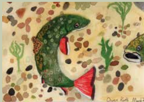
First place winner Owen Korth is a fourth grader from Bordentown.

The Fish Art contest is sponsored by the New Jersey chapters of Trout Unlimited.