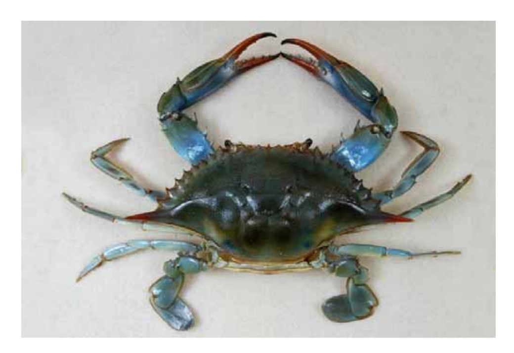
Blue Crab Callinectes sapidus