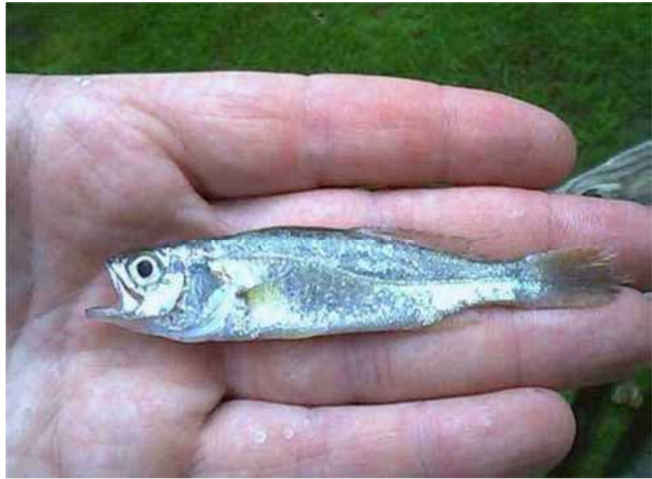
Weakfish Cynoscion regalis