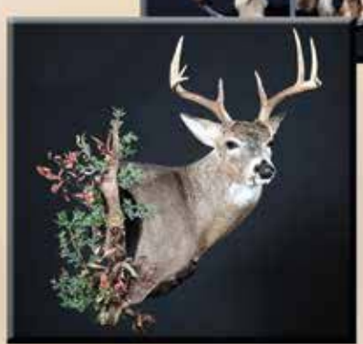
MEMBER, NJ TAXIDERMY ASSOCIATION 300 Penn. Ave.