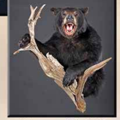
Matamoras, PA 18336