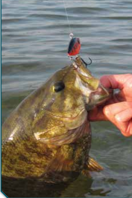
Sean Cochran/NJ Div. of Fish and Wildlife