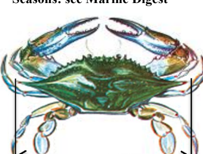
Blue Crab (measured point to point) Peeler or Shredder - 3 inches Soft -3\frac{1}{2} inches Hard – 4 ½ inches