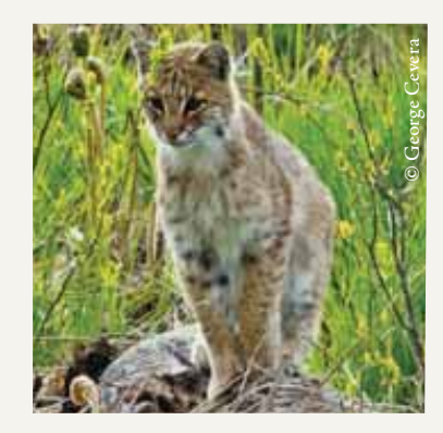
It is illegal to possess incidentally trapped or road-killed bobcat from New Jersey.