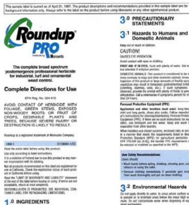
Figure 3. Herbicide labels and MSDS sheets provide a plethora of information regarding the safe application and handling of herbicides.

Read herbicide labels and Material Safety Data Sheets [MSDS sheets (the list of suggested readings provides a website where you can obtain these materials)]. Herbicide labels and MSDS sheets have information on the properties of the specific formulation in question. They also provide safety precautions, directions for handling, mixing, and applying the herbicide, information on required personal protection equipment, storage, cleanup, posting of the project site, and much more. When reading an herbicide label, the word “must” is used for actions that are required by law, while the word “should” is used for actions that are recommended but not required. After reading the label, consider whether or not you have the resources or can readily obtain the resources to handle the herbicide(s) safely. ALWAYS FOLLOW LABEL DIRECTIONS. IT IS AGAINST FEDERAL LAW TO DO OTHERWISE.