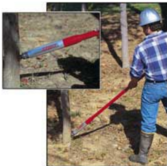
Figure 7. The EZ-ject ® lance is can be an efficient means of controlling larger shrubs and trees without non-target impacts. 540010.

Targeted application techniques, such as cut-stem and basal bark, usually require a much more concentrated solution of herbicide (25-100% active ingredient), as compared to foliar spray applications (typically 2-5% active ingredient). As such, be especially diligent when applying herbicides using these techniques so no other organisms will be affected. Regardless of the herbicide(s) used, be prepared to repeat treatments one or more times, as no treatment is 100% effective.