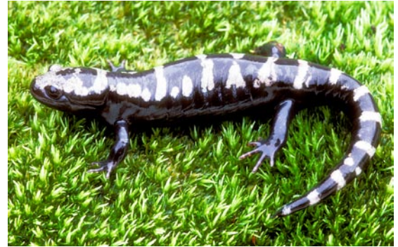
Figures 1a & 1b. The presence of wetlands such as this vernal pool (a), rare species such as this marbled salamander (b), and other sensitive natural resources will play a major role in deciding whether the use of an herbicide is appropriate and which herbicide and application technique to use.

If rare species are present, contact your state's natural heritage bureau and/or fish and wildlife agency to determine if there are any laws or regulations that pertain to your project. The presence of rare species may also influence what type of herbicide or application technique is used. For instance, if a rare plant was growing next to a plant targeted for control, a foliar spray application would not be appropriate. A more targeted technique, such as a cut-stem application, might be better suited (but note that in some cases herbicides applied to cut stumps or as a basal bark treatment have moved from the roots of the target plant into the roots of adjacent plants, perhaps through natural root grafts). You will find out more about application techniques later in this section.