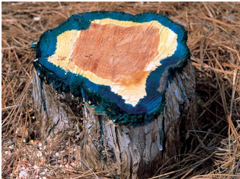
Figure 5. Cut-stem applications are more targeted than foliar applications and therefore produce fewer non-target impacts.