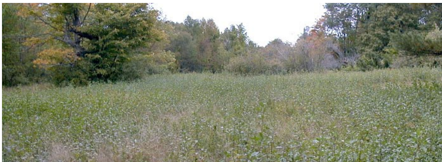
Figure 2. Buckthorn that has been mowed annually for numerous years can degrade a grassland community. When choosing an herbicide to help restore such a community, choose one that will not have an impact on the underlying grasses.

Once a list of potential herbicides is chosen, review the behavioral properties of each product (Table 2). How long do they last in the environment? How toxic are they to animals? How mobile are they in the ground? Choose the least persistent, least toxic, and least mobile herbicide(s) that will do the job safely and effectively. Another consideration is the herbicide's selectivity. That is, does the herbicide kill a wide range of plants, or a select group of plants? If trying to control glossy buckthorn in a grassland community using a foliar spray application, an herbicide that doesn't kill grasses, such as triclopyr (active ingredient in Garlon® and Brush-be-Gone®), would be preferred, all other things being equal.