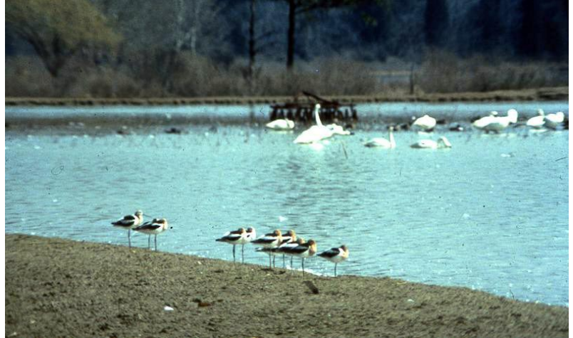
Figure 6. Waterfowl and upland habitat management can work together. Disking is used to improve habitat for thousands of ducks, geese, and wading birds, but the disk is an equally important tool for maintaining bobwhite quail habitat on Buck Range Farm.

Two ten-acre impoundments were constructed in the 1990s to provide wintering waterfowl habitat. Interestingly, these areas have also been beneficial to bobwhite quail. The impoundments are drawn down in early spring to encourage annual seed-producing plants. Because the areas are essentially dry and fallow in the summer months, first year vegetation and bare ground are abundant, creating preferred bugging areas for bobwhite broods. In autumn, the impoundments are filled by natural rainfall during autumn, producing high-quality waterfowl and wading-bird habitat.