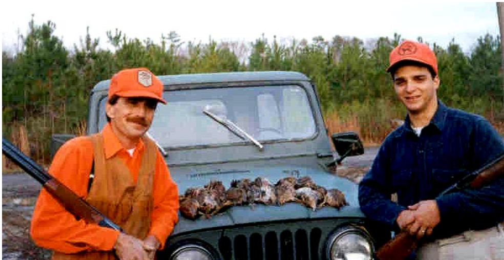
Figure 1. A hunt at Buck Range Farm is like going back in time to the “good-old-days.”

Most young hunters would love to see what it was like in the “good-old-days”, to experience the days afield that they hear their fathers and grandfathers telling stories about. Likewise, the older generations, the ones that tell the stories, would love to re-live the experiences that live vividly in their memories. On the Eastern Shore of Maryland, most story-telling sessions turn to the 1950s and 60s, when wildlife was plentiful. It was a time when waterfowl hunting on the Chesapeake Bay was a way of life and every respectable hunter had a good bird-dog. Unfortunately, the good-old-days are just a memory for most. Waterfowl populations have suffered with increased pollution of the bay, and bobwhite quail have declined over 90% since the 1960s due to changing land uses.