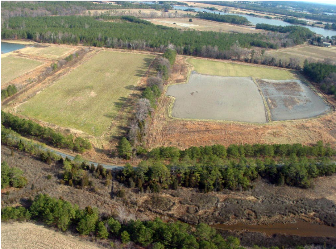
Figure 5. The proximity and arrangement of crop fields to other habitat types, such as field borders and hedgerows, creates favorable conditions for bobwhite quail.

Cropping is an important component of the Buck Range Farm management regime, both to provide food and cover for wildlife as well as farm income. Corn, soybeans, or sorghum is planted annually on the 85 acres of existing cropland, with minimal use of pesticides and herbicides. Cropland is only tilled one out of four years, with no-till planting methods used the remainder of the time. Although cropland is primarily managed as a wintering waterfowl food source, the proximity and arrangement of crop fields to other habitat types, such as field borders and hedgerows, create favorable conditions for bobwhite quail.