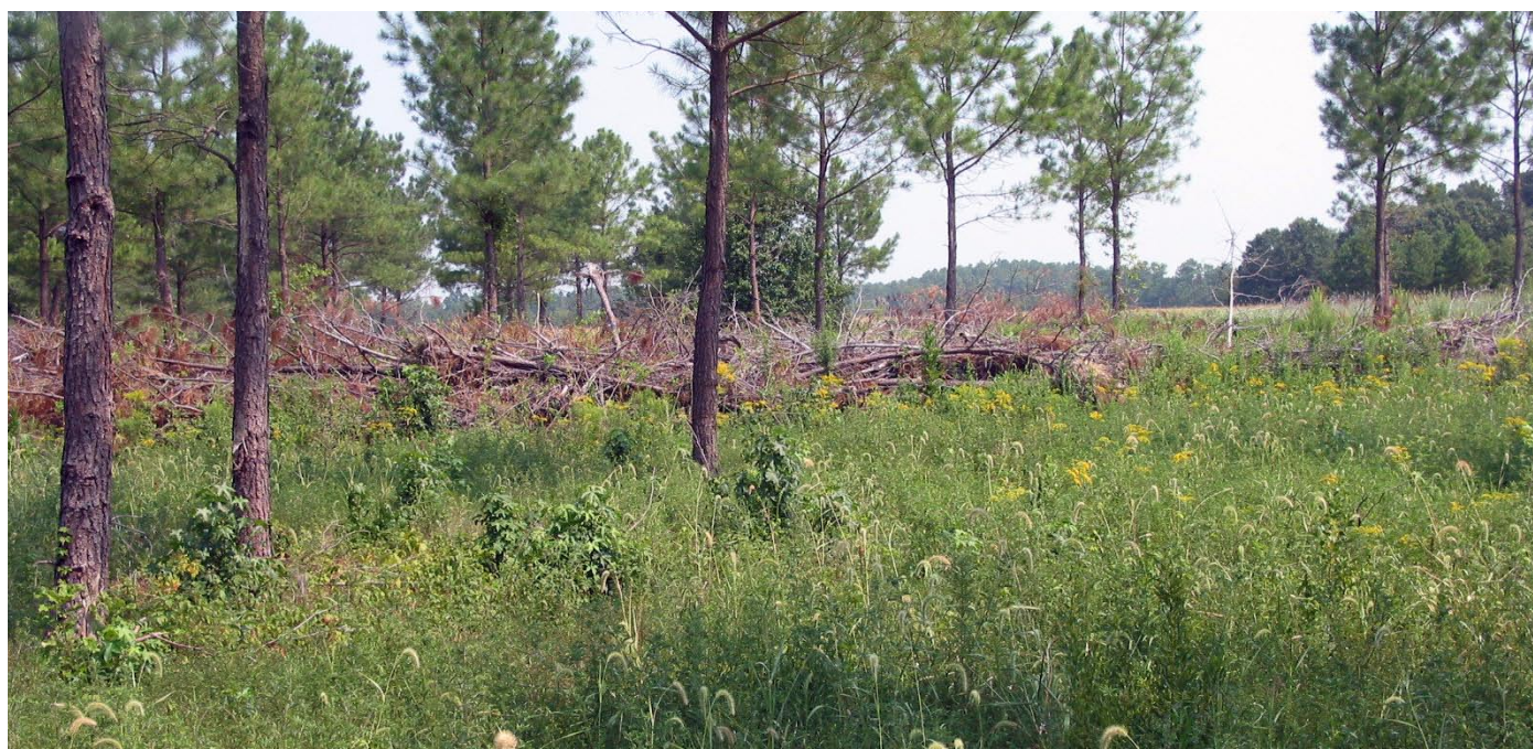
Figure 4. This previously loblolly pine forest of Buck Range Farm was thinned heavily one year before the photo was taken. A lush understory of native plants has been established, providing ideal habitat for a variety of early-successional species.

A large portion of the pine forests on Buck Range Farm have been either commercially harvested using clearcuts or non-commercially thinned. Both practices have been successful in increasing habitat quality for early-successional species. Two recent clearcuts totaling about 40 acres produced high-quality habitat for quail for five to eight years while providing additional income from timber sales (see cover type map). Perhaps more beneficial and visually attractive was the thinning of about ten acres of loblolly pines. Approximately 70% of the pines were cut and piled in windrows. The additional sunlight encouraged an understory of native grasses and forbs to revegetate, creating ideal food and cover for bobwhites while the windrows provided the benefit of additional escape cover for quail and cottontails. Korean lespedeza is often sown where tree thinnings have occurred to offer winter food and spring nesting areas for quail. Prescribed fires are used every three to five years in February or March to control common volunteer species such as sweetgum and oak, while the overstory pines are left alive. The burning rejuvenates the site, producing lush herbaceous growth at ground level. Refer to the prescribed burning section of chapter 10 for more details on the use of fire to enhance habitat.