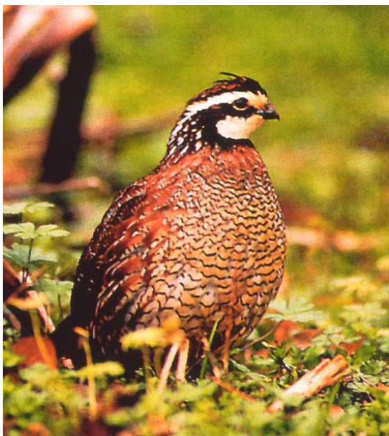
Figure 7. Bobwhite quail have disappeared from most farmed landscapes, but Buck Range Farm still harbors 15 to 20 coveys of wild quail each year.

The benefits of the intensive habitat work on Buck Range Farm are evident simply by walking around the property. In the spring, whistling bobwhites, gobbling turkeys, and an array of songbirds such as eastern meadowlarks and field sparrows can be heard everywhere. Autumn and winter are the times when the landowner's attention turns to hunting, a favorite pastime. Prior to the intensive upland habitat management, there were fewer than five bobwhite coveys on the entire farm. Covey numbers have increased over 300%; the farm now holds 15 to 20 coveys of wild bobwhites. Prolonged snow cover in the winter of 1996 temporarily reduced the number of breeding pairs, but with suitable habitat the population quickly rebounded within two years. Since that time, a typical afternoon hunt results in five to ten covey flushes. Habitat management of the wetlands also has produced desired results; harboring 500 to 1,000 puddle ducks annually, including mallards, widgeons, and pintails.