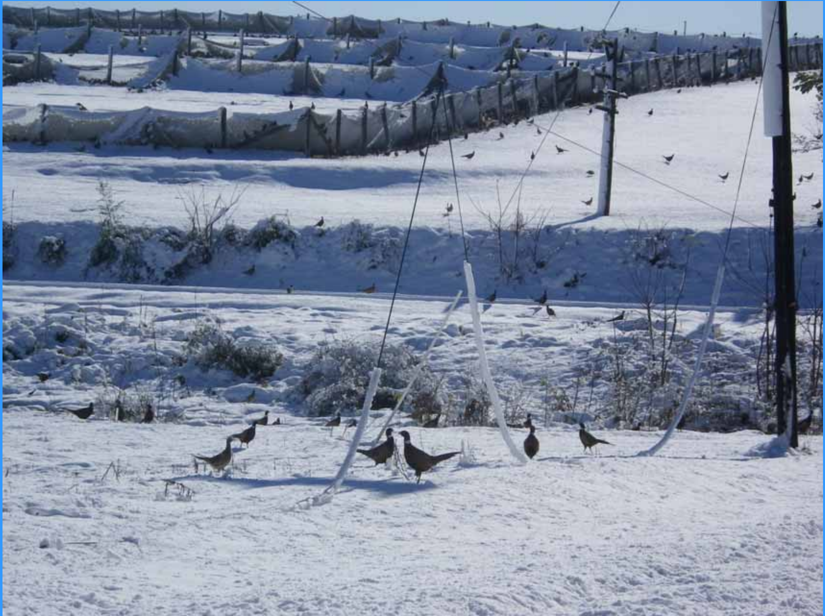
OCTOBER 2011 SNOWSTORM