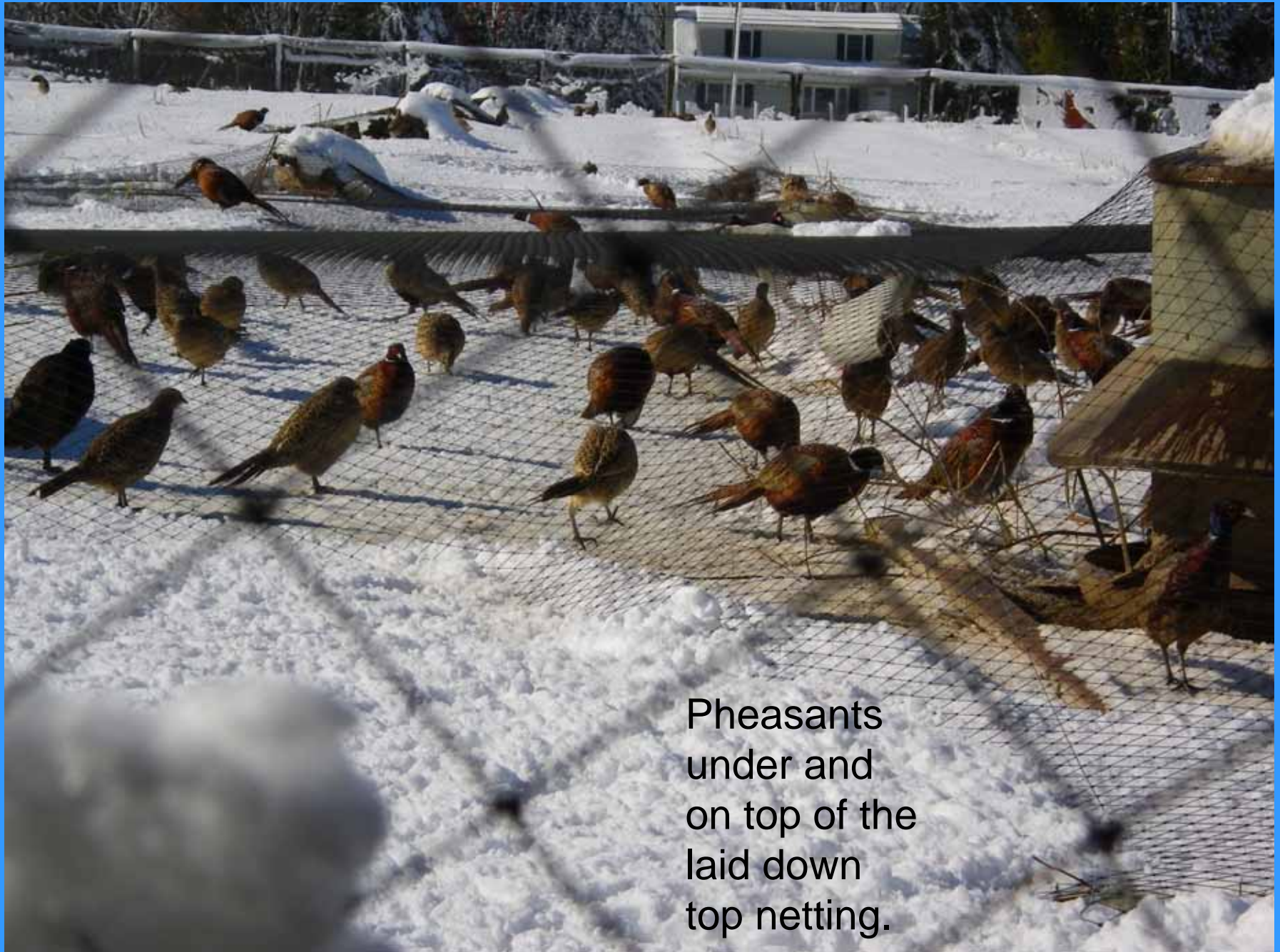
Pheasants under and on top of the laid down top netting.