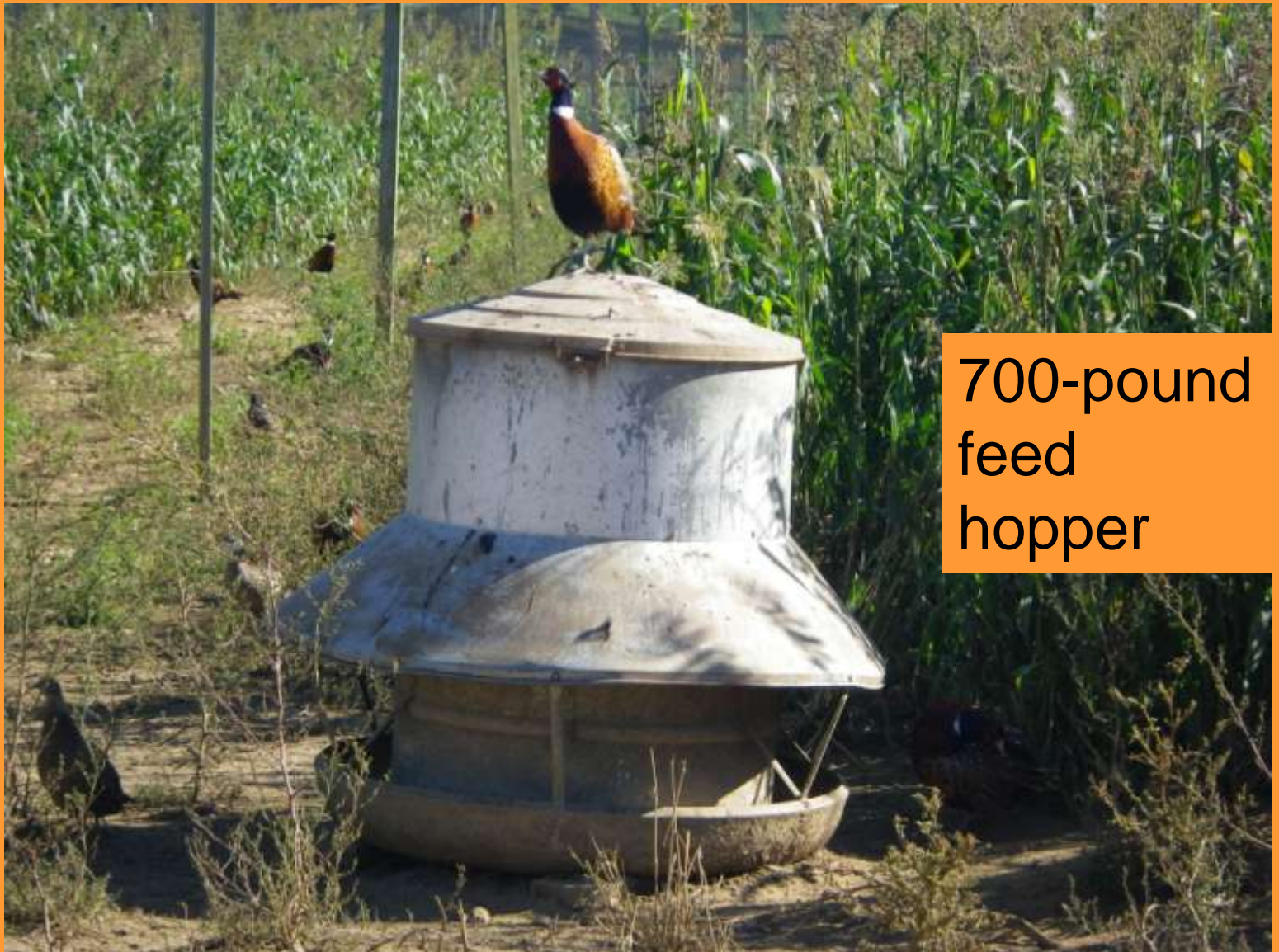
700-pound feed hopper