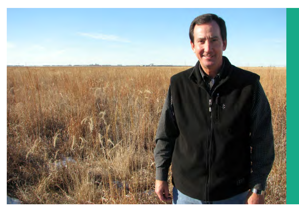
"The goals of the Wetlands Reserve Program met our goals perfectly. We wanted to create the best wetland out there, and the Wetlands Reserve Program provided us the technical and financial assistance to make that happen."

WRP projects in these states have the potential to reduce soil loss by as much as 124,000 tons per year. That's enough soil to fill over 3,600 dump trucks. The amount of soil could prevent over 400 tons of nitrogen and 5.5 tons of phosphorus from washing downstream in the area alone. (Tangen 2008)