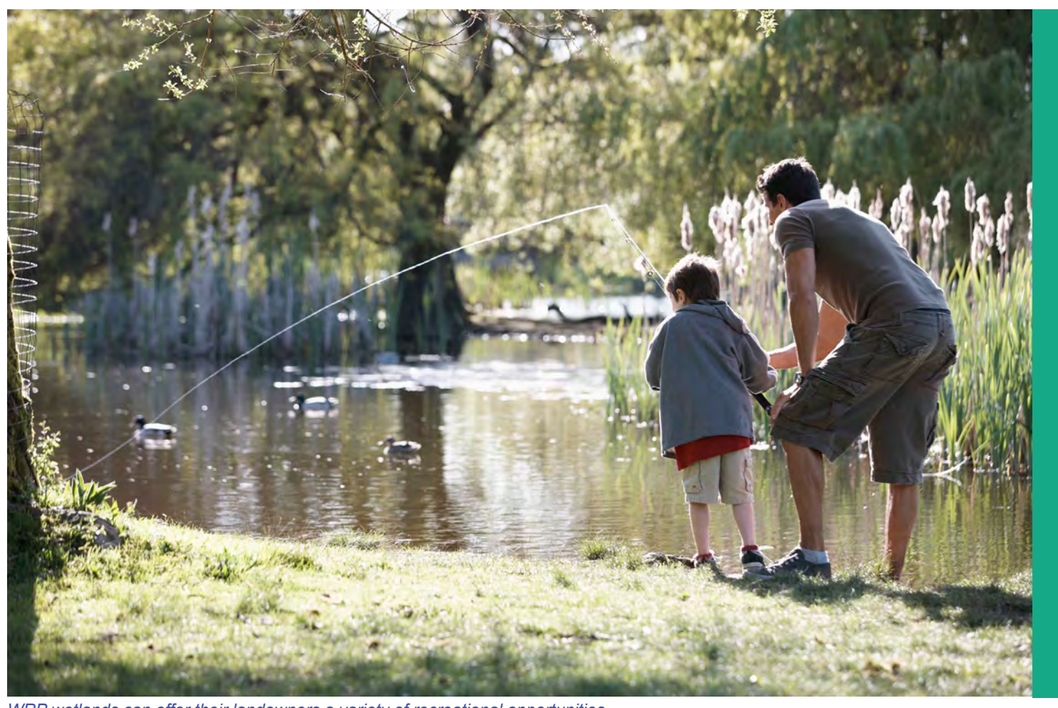
WRP wetlands can offer their landowners a variety of recreational opportunities.