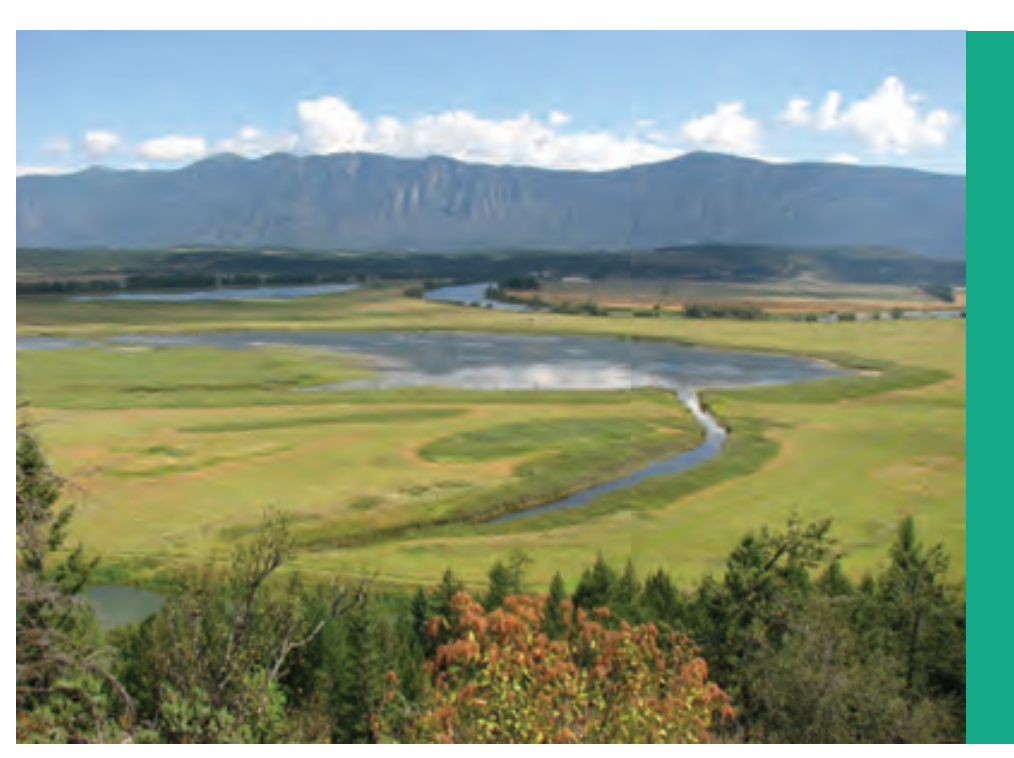
The Boundary Creek WRP in northern Idaho provides habitat for the white sturgeon, caribou and grizzly bear.

The key to WRP's success is its involvement and enthusiasm from private landowners and NRCS conservation partners. Landowners across the country have watched wetland habitat positively transform their land and, their community. There are thousands of acres still on the enrollment waiting list. WRP has proven to be a program where NRCS, landowners and many various partners can work together to achieve truly cooperative conservation resulting in long-term benefits on a landscape scale that will ensure our wetland resources are available for future generations.