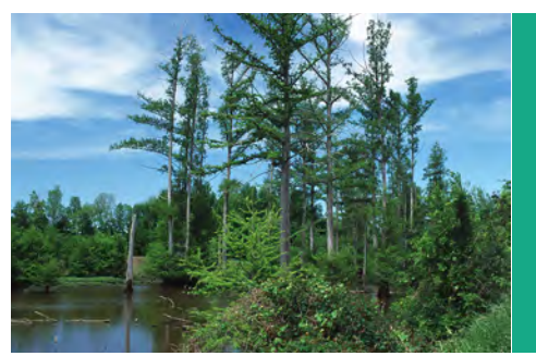
Remnant of a cypress/tupelo wetland in central Mississippi as part of a WRP easement.