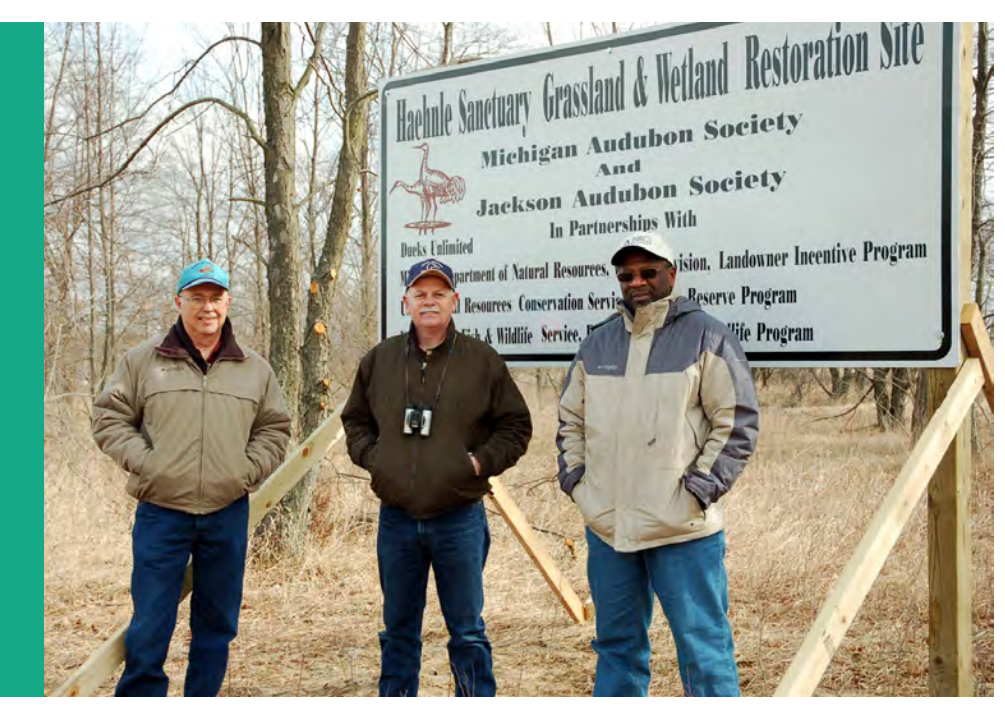
WRP funds helped restore wetland habitat in a Michigan Audubon Society sanctuary, famous for thousands of Sandhill cranes who visit during their migration and for Massasauga rattlesnake habitat, a state Species of Concern. Partners included Ducks Unlimited, Michigan and Jackson Audubon Societies, Michigan Department of Natural Resources and the U.S. Fish & Wildlife Service.