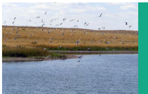
WRP wetland habitat is helping with erosion control in the Prairie Pothole region of North Dakota in addition to providing critical waterfowl breeding and nesting habitat.