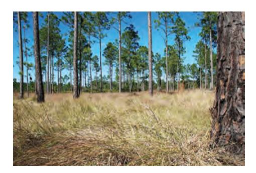
Over 26,000 acres of seasonal and forested wetland habitat was protected as part of the Fisheating Creek WRP project in Florida.

Five properties of over 26,000 acres owned by four landowners along Fisheating Creek in the Northern Everglades Watershed have created one of the largest WRP easement areas in the Nation. Fisheating Creek is one of the last free-flowing waterways entering Lake Okechobee, a favored recreational spot and an area with an impact on water quality and quantity concerns in the Everglades. This landscape also supports 19 Federally Endangered and Threatened species, including the red-cockaded woodpecker, wood stork and Florida panther.