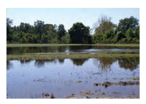
A 211-acre WRP easement in the Mississippi River Drainage area of western Kentucky is only a half-mile from the Reelfoot National Wildlife Refuge.