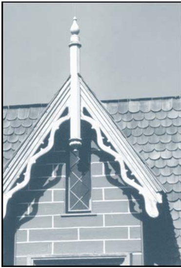
Gable Detail, The Hermitage, Ho-Ho-Kus Borough. SR Listed 5/27/71