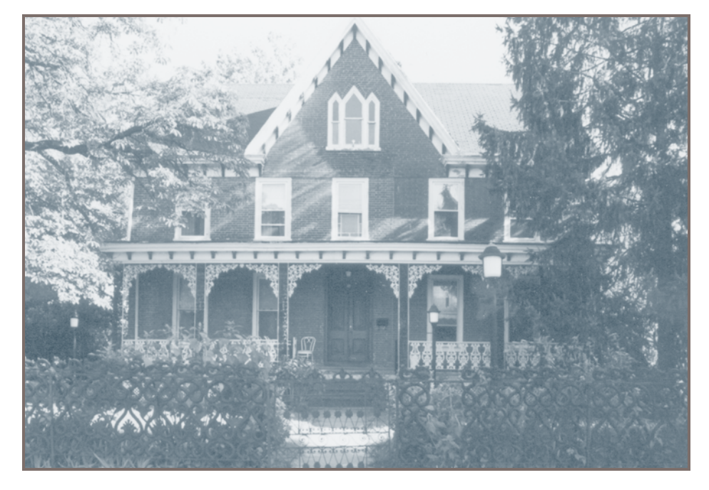
The historic Rulon House undergoing rehabilitation.

On the interior, the house retains a similar high degree of integrity. While some modern finishes were applied over the historic finishes, we have only lost the baseboard in three rooms and a doorknob from a second floor door. The Victorian details remaining include embossed doorknobs and escutcheons, embossed hinges, window locks and pulls, four-panel, five-panel, and seven panel doors with bolection moldings, and plaster ceiling medallions for gas chandeliers. Two of the original three chandeliers remain in place. One has been fully converted to electric, while the second has three electric and three gas fixtures. One of the two retains all but one original glass globe. In the front hall, a gas light fixture mounted atop and wired