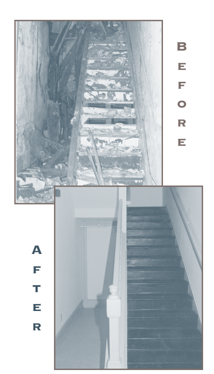
206 Academy Street, Trenton, NJ