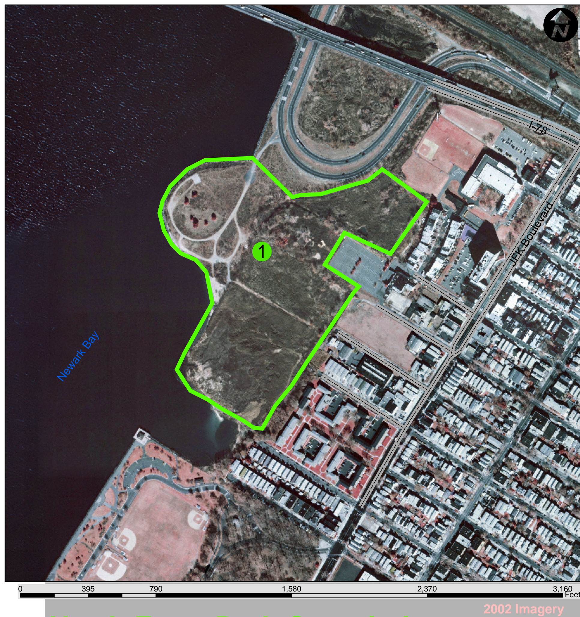
North Forty Park Completion: Wetland Restoration, observation decks, bike trails, park amenities

NOT SHOWN: Additional measures to address combined sewer overflows or storm water concerns also will be funded with the balance of funds from the settlement.