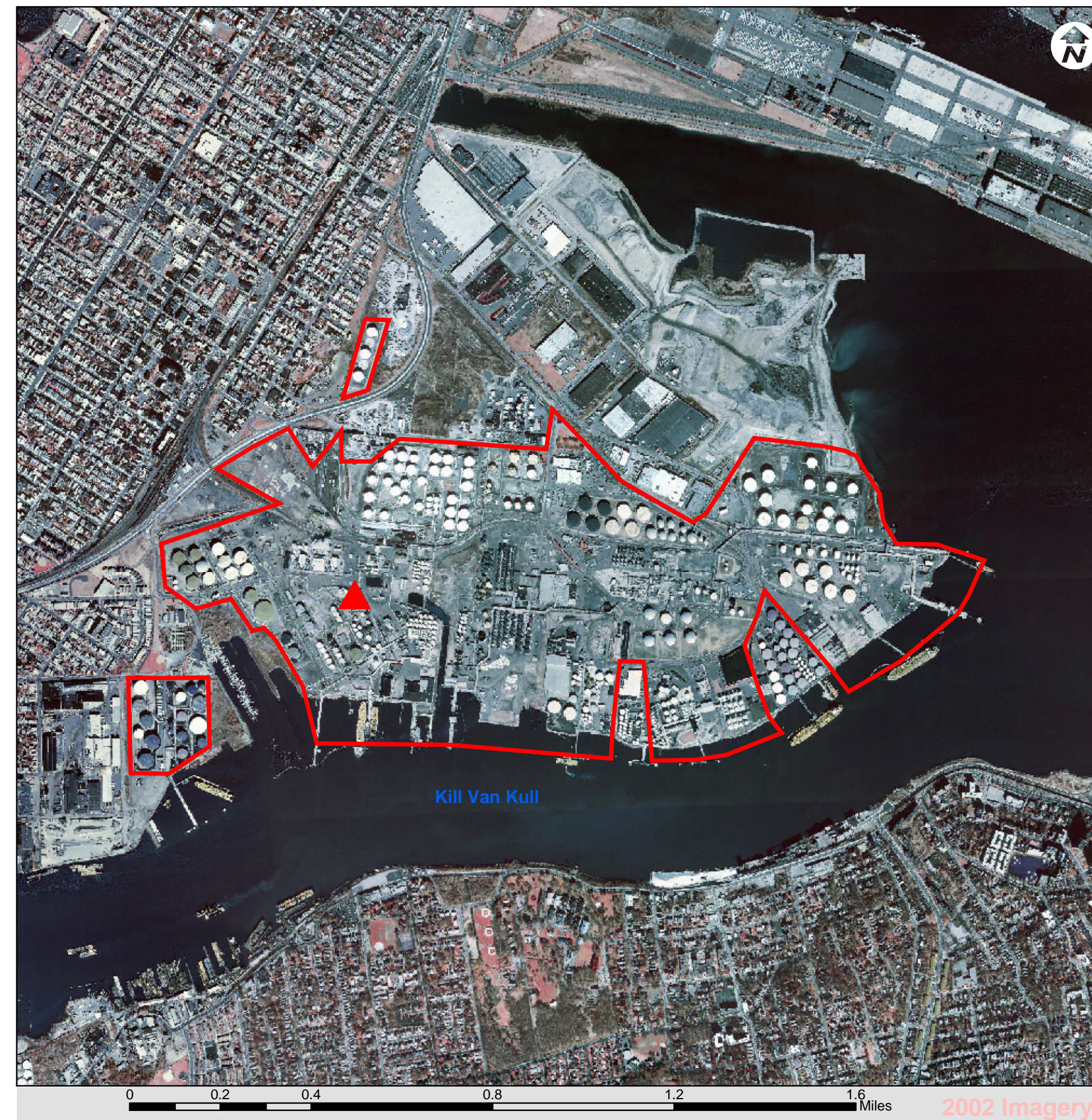
IMTT, Bayonne Site