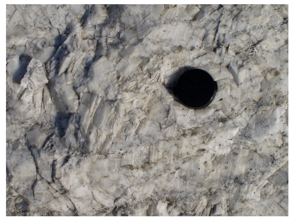
Figure 2. Outcrop of fairly typical coarse-grained Franklin Marble from near Franklin, Sussex County. Lens cap for scale.

detailed geologic mapping and studies using geochemistry, combined with interpretation of the isotopes of carbon, strontium and uranium-lead.