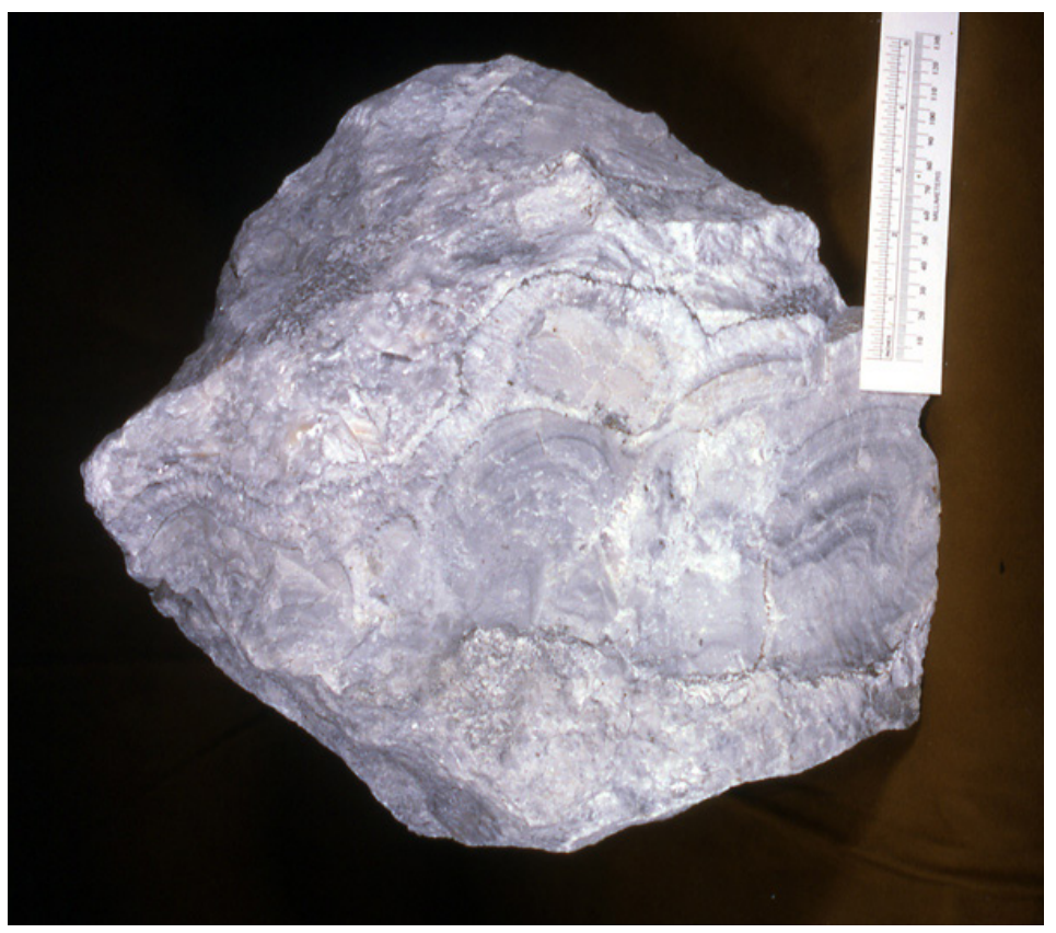
Figure 4. Wavy-laminated, dark gray colonies of stromatolites (beneath ruler) in Franklin Marble.

Jersey: U.S. Geological Survey Atlas Folio 161, 27 p., scale 1:62,500.