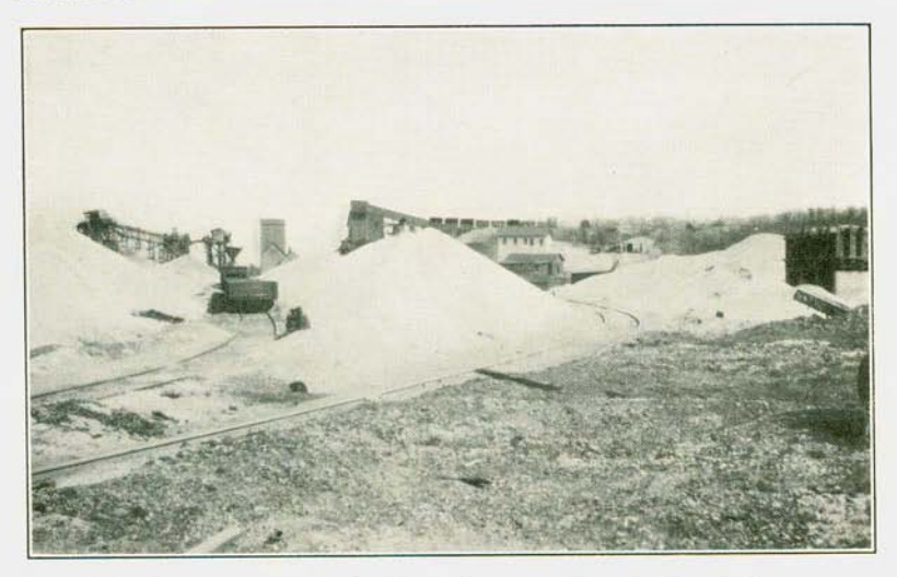
(a) Bennet plant of the New Jersey Sand and Gravel Company, located three miles east of Farmingdale, Monmouth County.

N. J. Dept. Conservation and Development. Bulletin No. 34