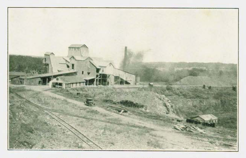
(a) Plant of the Morris County Crushed Stone Company (trap rock) at Millington, Morris County.