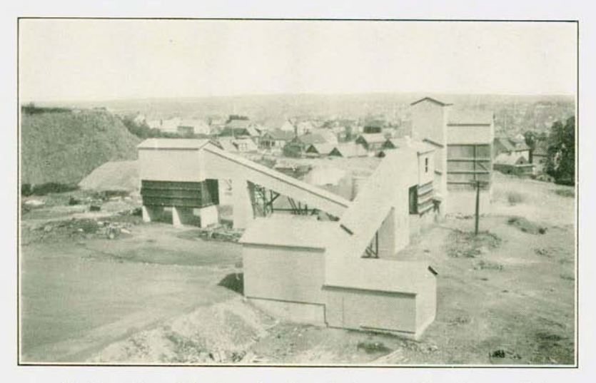
(b) New plant of the Sowerbutt Quarries (trap rock) at Prospect Park, Passaic County. NEW JERSEY GEOLOGICAL SURVEY