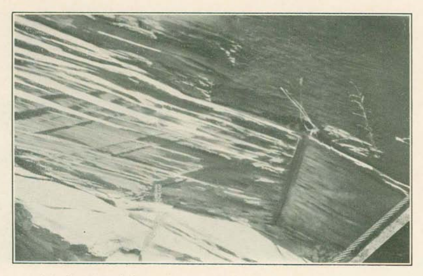
(a) A portion of the northeast wall of the Lafayette slate quarry. View taken to show opposite dip of bedding and cleavage.

N. J. Dept. Conservation and Development. Bulletin No. 34