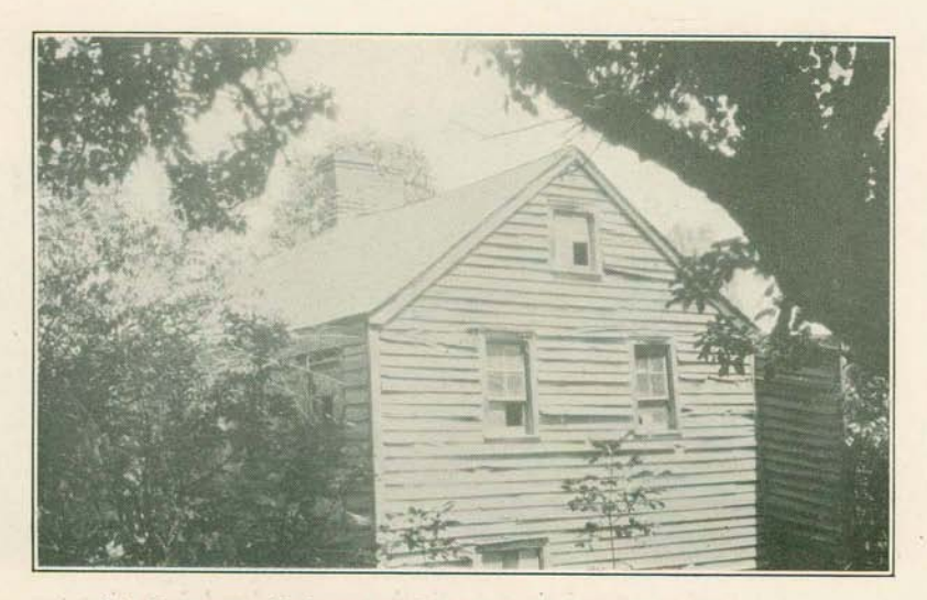
(b) Sixty-year-old house in Lafayette roofed with slate from the Lafayette quarry. The slate is still in perfect condition.