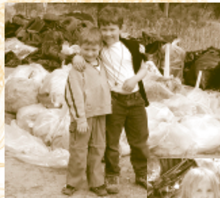
All ages join in to help clean up the Hamilton Preserve.

debris, at the Crossley Preserve in Ocean County. The volunteers in this group included the South Jersey Geocachers, the Jamesburg Field and Stream Hunting Club, and several individual volunteers. On September 18,