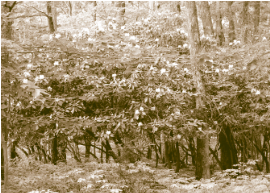
Rhododendron (R. maximum) at Blair Creek-Blair Academy Preserve.

T he significance of the Blair Creek Preserve is that it represents a portion of a 12,000-acre block of contiguous forest, unbroken by human activities. Species known or suspected to inhabit the Preserve include Cerulean warblers, red-shouldered hawks, wood turtles, and timber rattlesnakes.