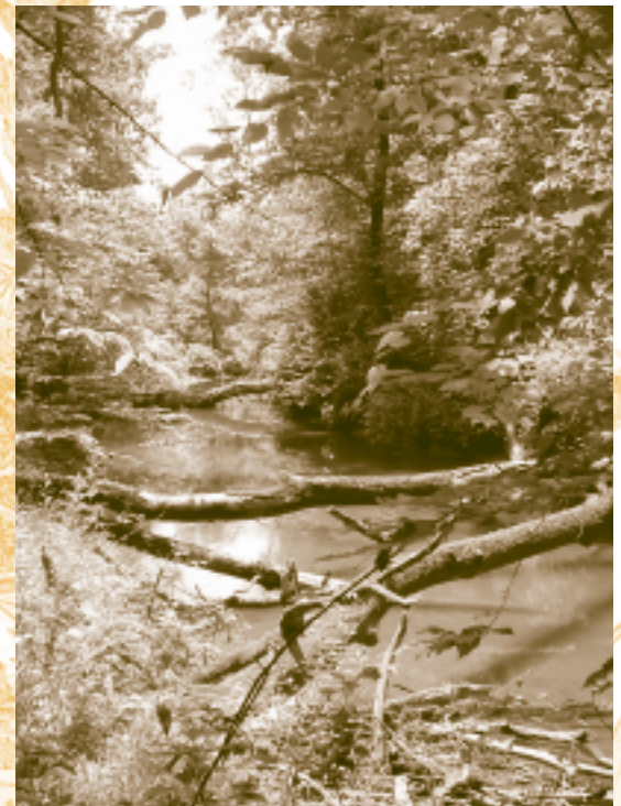
Papakating Creek Preserve

D uring 2004, the New Jersey Natural Lands Trust and the Wetlands Mitigation Council executed an amended Memorandum of Understanding (MOU) that, among other things, provides for the transfer of $1 million from the Wetlands Mitigation Fund to the Trust's Wetlands Mitigation Acquisition Fund. This money is to be used by the Trust to acquire freshwater wetlands and associated transition areas that have the potential to be restored and/or enhanced. This MOU authorizes Trust staff to proceed with the direct acquisition of ecologically significant properties within 13 pre-approved Natural Heritage Priority Sites that support significant wetlands and wetland transition areas. Natural Heritage Priority Sites, a product of the Office of Natural Lands Management's (ONLM) Natural Heritage Program, represent some of the best remaining habitat for rare species and ecological communities in the State. Trust staff has already identified one acquisition within the Papakating Creek Priority Site and hopes to assist Green Acres in the acquisition of this significant property.