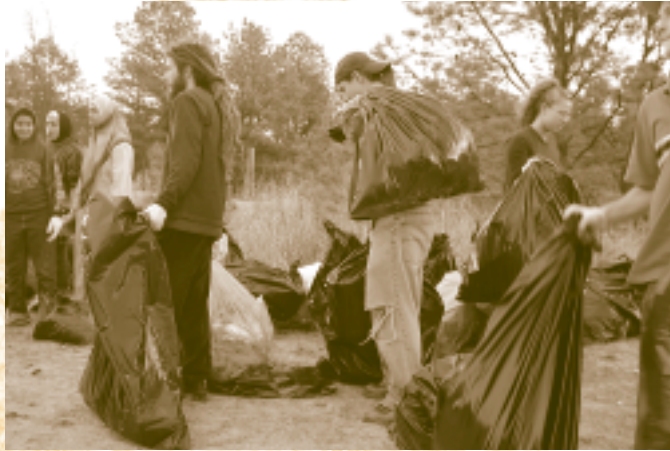
New Jersey Community Water Watch volunteers clean up Hamilton Preserve.

Besides volunteer monitors, approximately 518 volunteers are on-hand for management projects throughout the State—these volunteers consist mostly of hunters with permission to deer hunt on certain Trust preserves. Many of these hunters are ready to come to a workday after receiving a simple phone call or email. In fact, in 2004, three such workdays were held at Trust preserves. On March 27, a huge clean up was conducted at the Hamilton Preserve in Atlantic County. This clean up was sponsored by New Jersey Community Water Watch