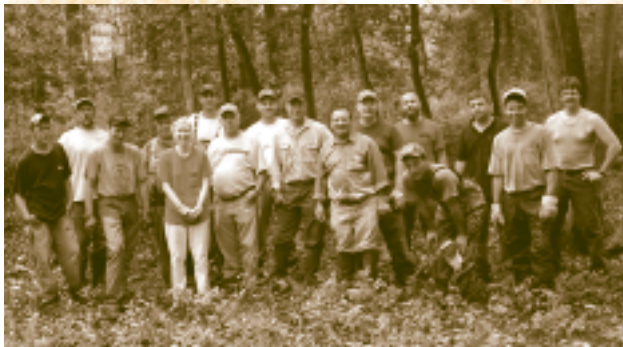
A group of NJNLT hunter/volunteers pose after a long day of cleaning up debris dumped at the Bear Swamp Preserve.

Currently, the Trust has volunteers monitoring 56 of the 115 Trust preserves, from Abraitys Pine Stand to Whale Pond Brook and from Atlantic County to Sussex