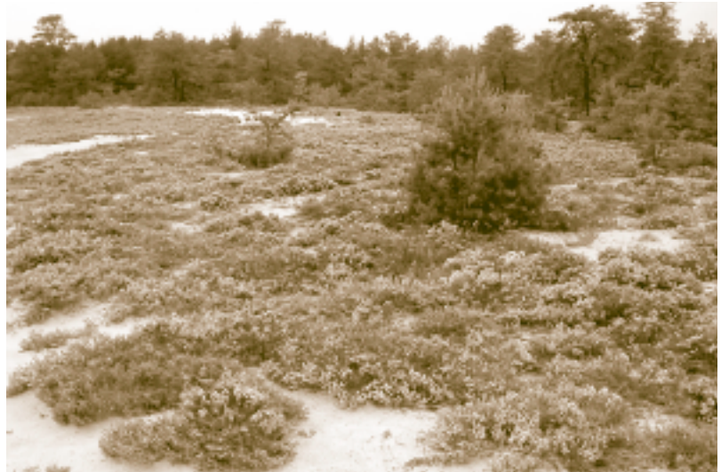
Pine Barren hudsonia (Hudsonia ericoides) at Crossley Preserve.

O n January 8, 2004, the Trust received the final land donation of the multifaceted Leisure Technology donations from the New Jersey Chapter of The Nature Conservancy (TNC). This 1,069-acre donation is now part of the Trust's Crossley Preserve. Crossley is the Trust's largest holding and consists of over 2,600 acres of pitch pine uplands and lowlands in central Ocean County, within a largely undeveloped 7,000-acre area of the New Jersey Pine Barrens known as the Berkeley Triangle. The Crossley Preserve provides important habitat for rare plant species including New Jersey rush, Pickering's morning-glory, Pine Barren smoke grass, Pine Barren reed grass, and Knieskern's beaked-rush. It is also home to several rare Pine Barren's reptiles and amphibians, including the pine snake, a threatened species, and the corn snake and Pine Barrens treefrog, both endangered species.