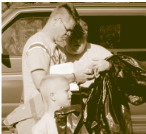
Volunteers preparing for the Crossley workday.

initiative to clean up on their own. Here are some of their quoted reports, “In September, I picked up a few cans and bottles on the west side of the preserve and a leaf bag full on the east side”, “Removed two TV’s, boxes of old shingles, several tires, and some light trash”, “I did remove seven old tires and some dumped metal during my deer scouting trip this winter”, “I spent a couple of hours cleaning up an old dumped pile of glass”. Repeat these quotes again and again and you will realize what a difference Trust volunteers make!