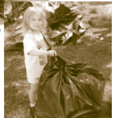
A young girl with a trash bag nearly as big as her at the Crossley workday.

twenty hunters showed up for a workday at the Bear Swamp Preserve in Burlington County to clean up a large impro-