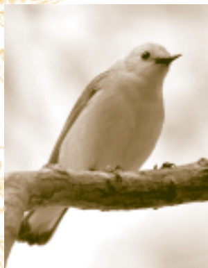
Prothonotary warbler